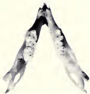
FIG. 1. Occlusal views of the skull and mandible of the holotype of Allactaga firouzi n. sp., FMNH 112348.