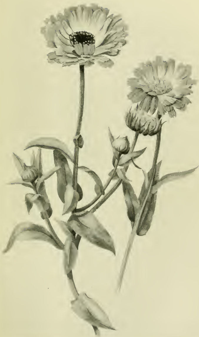
THE COMMON MARIGOLD ( Calendula officinalis ).