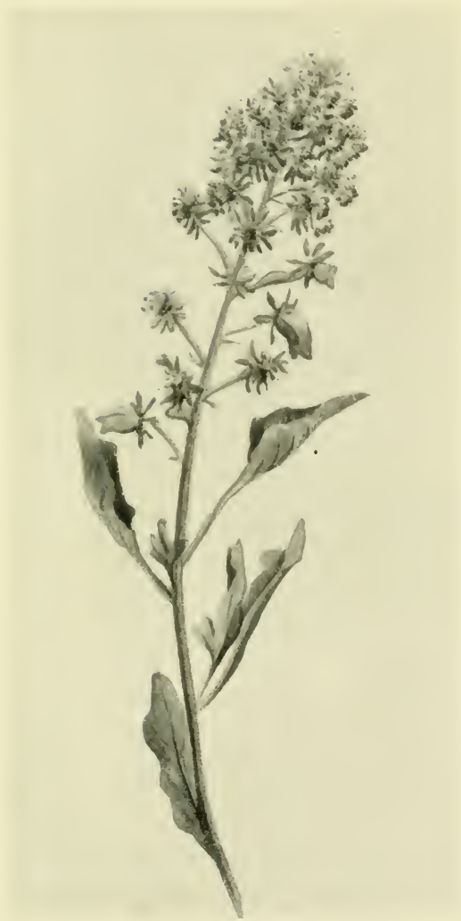
MIGNONETTE ( Reseda odorata ).