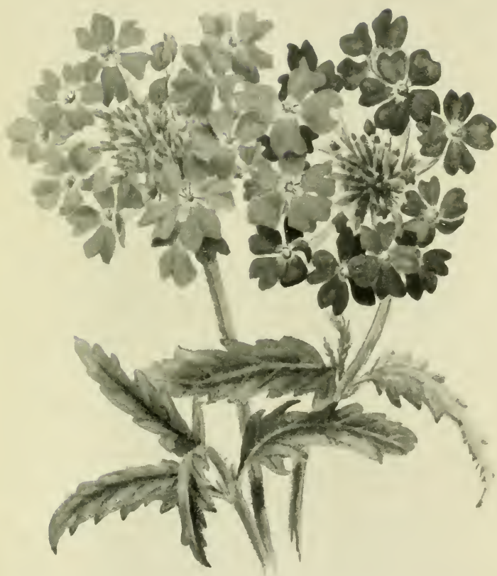
VERVAIN ( Verbena ).