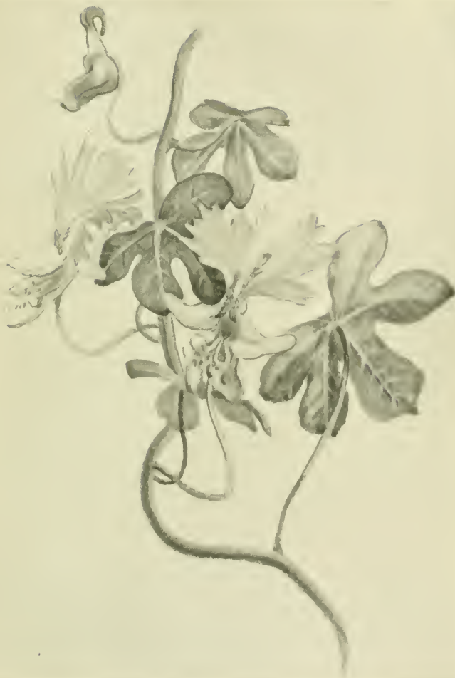
CANARY CREEPER ( Tropaeolum aduncum ).