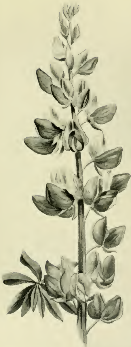
AN ANNUAL LUPINE ( Lupinus mutabilis Cruickshanki ).