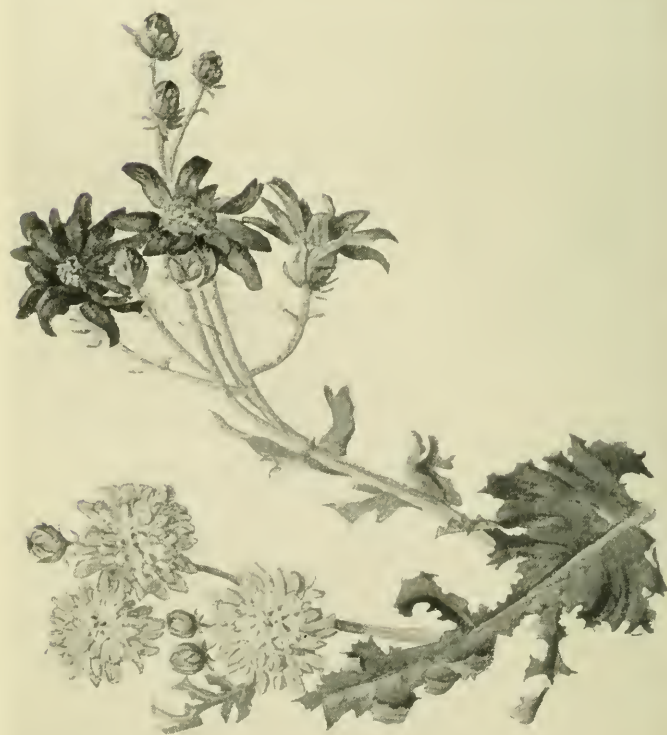
JACOBÆA ( Senecio elegans ). Double and single.