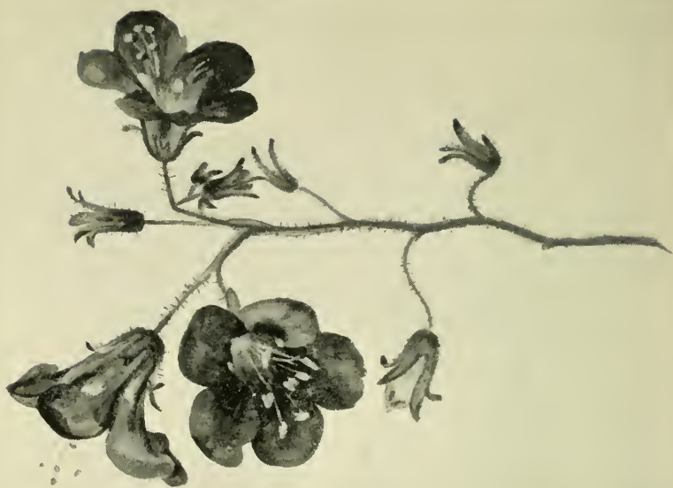
PHACELIA CAMPANULARIA. [To face p. 207.