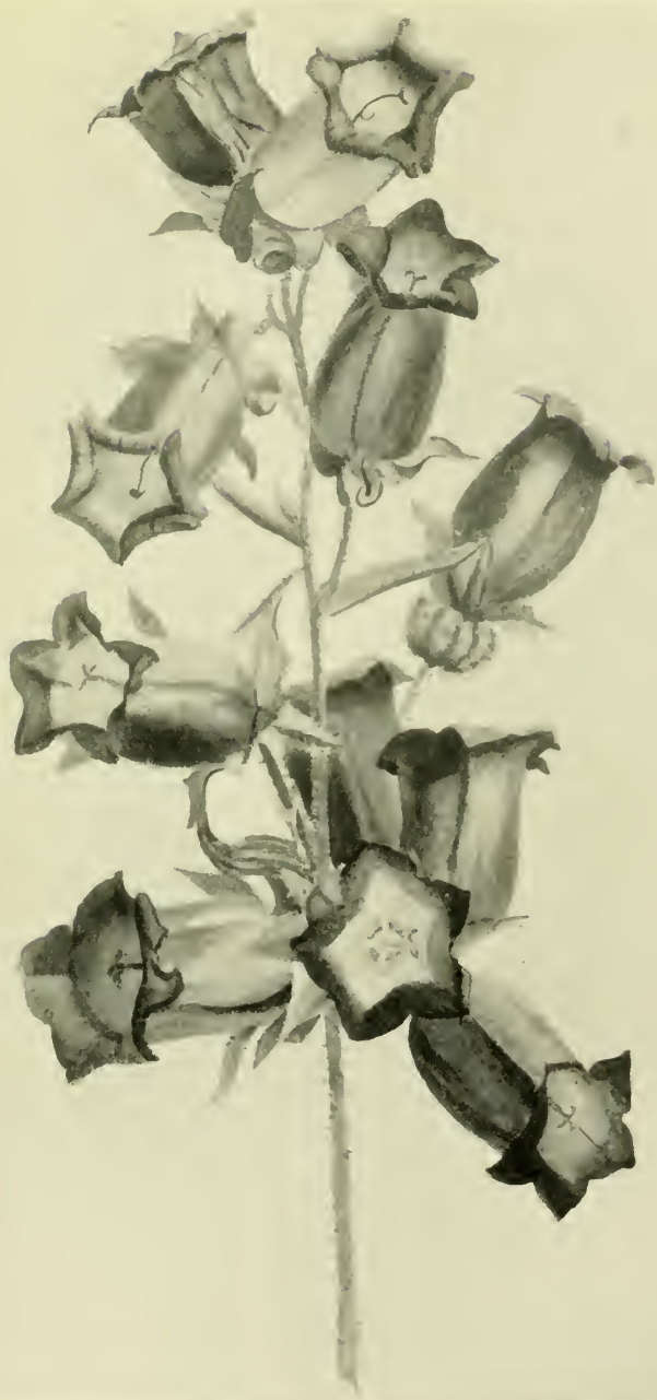
CANTERBURY BELLS ( Campanula medium ).