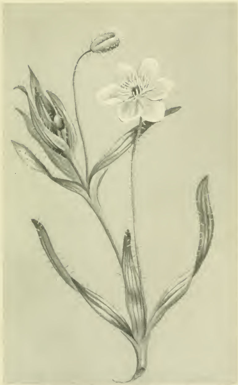
CREAM CUPS ( Platystemon californicus ).