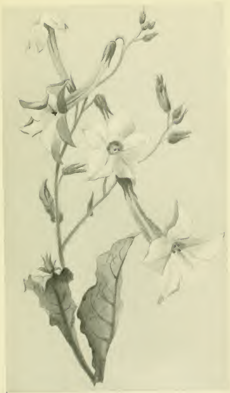
TOBACCO PLANT ( Nicotiana glauca ).