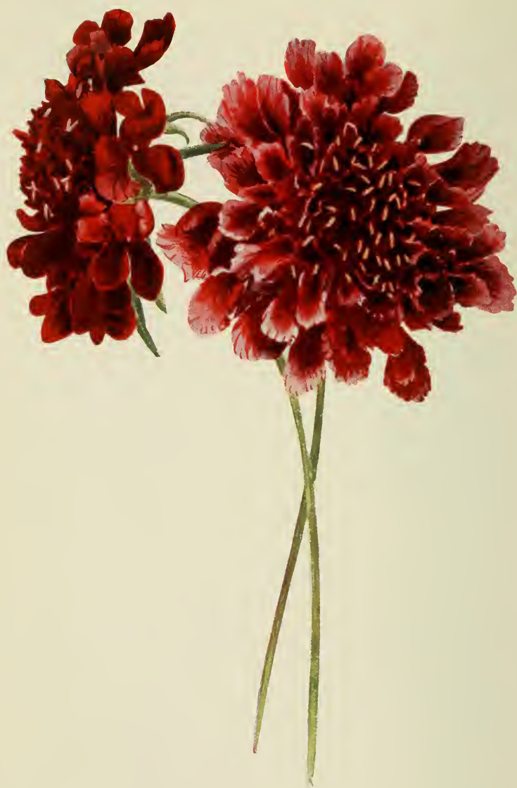
SCABIOSA. Sweet Scabins.