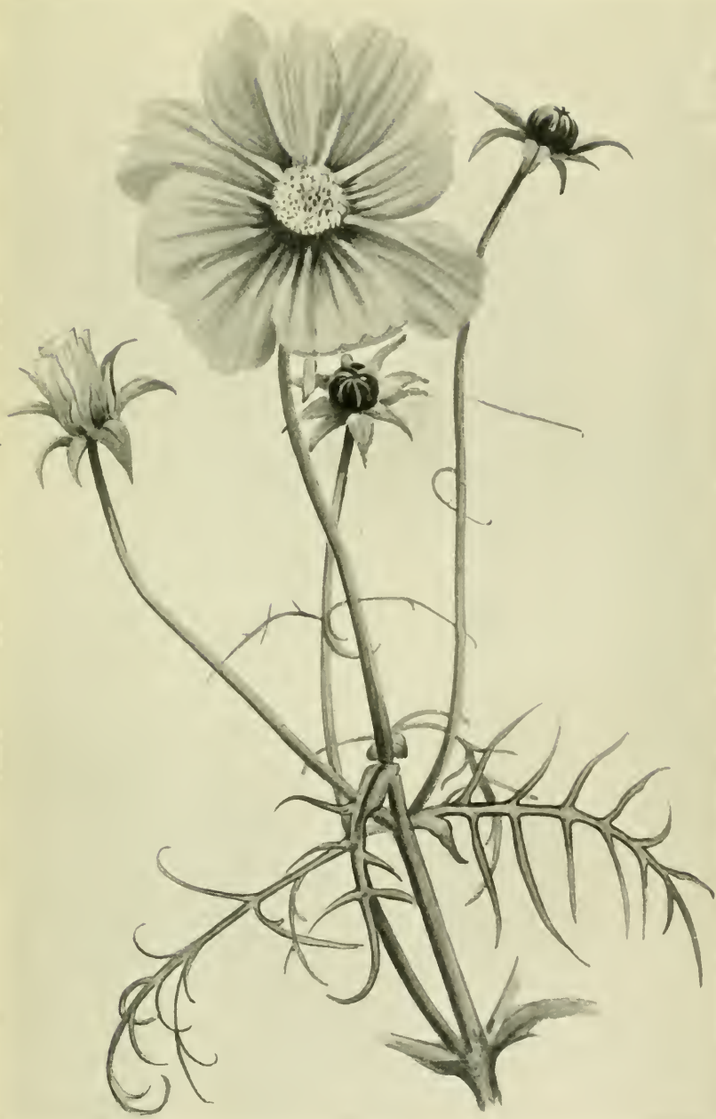
THE MEXICAN ASTER ( Cosmos bipinnatus ).