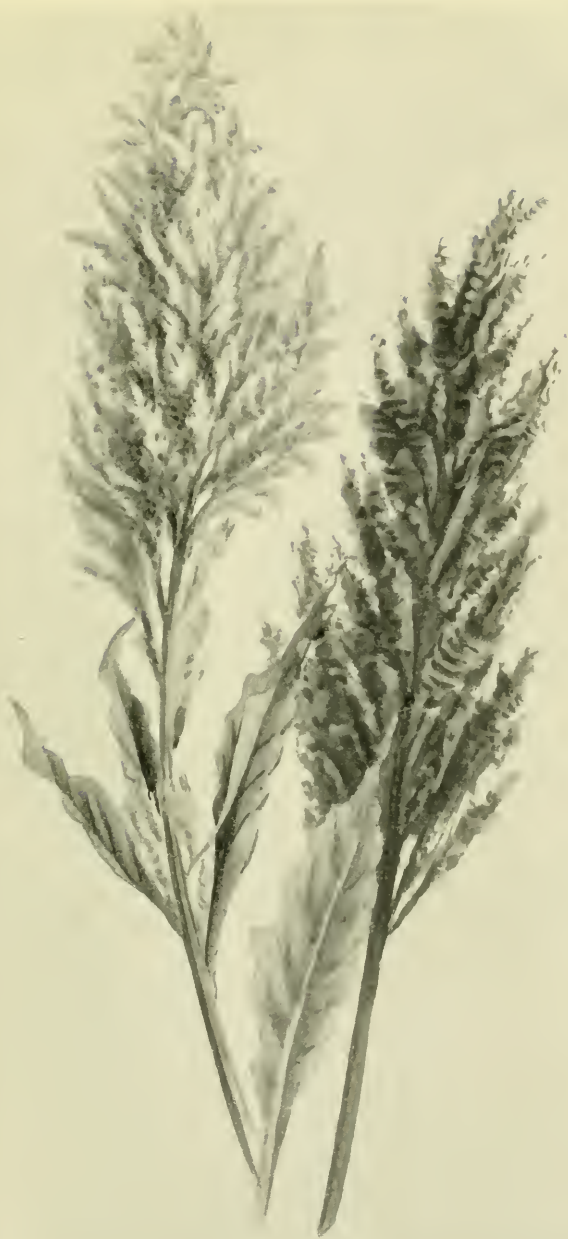
THE FEATHERED COCKSCOMB ( Celosia plumosa ).