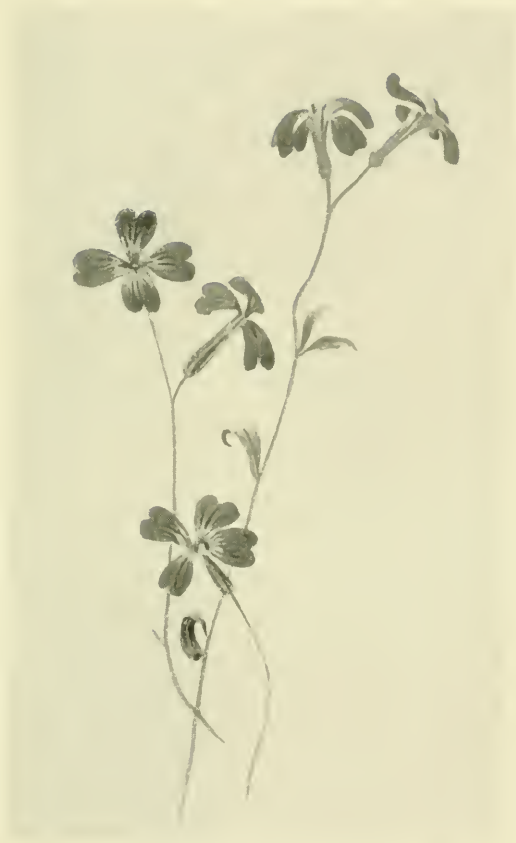
VIRGINIA STOCK ( Malcolmia maritima ).