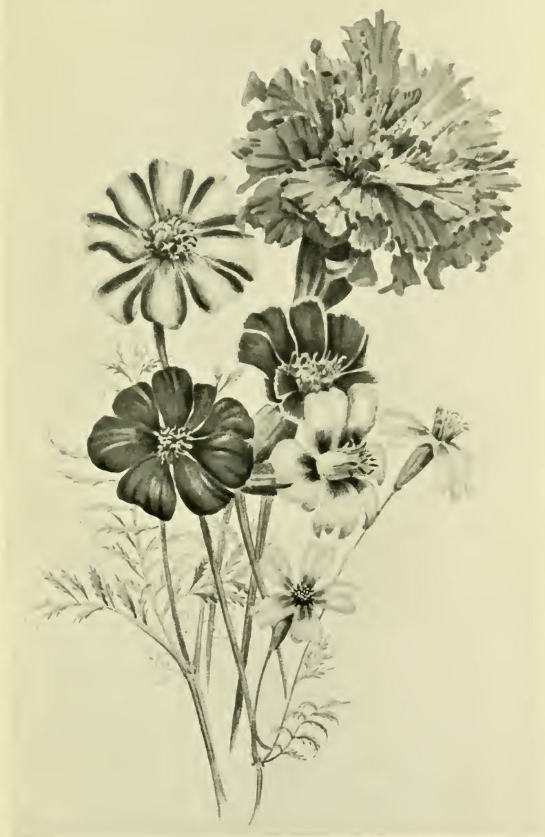
1. AFRICAN MARIGOLD ( Tagetes erecta ).