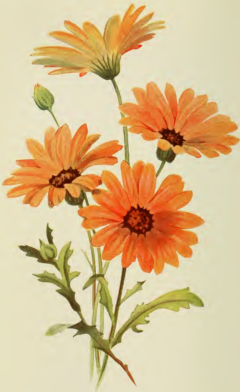
DIMORPHOTHECA AURANTIACA. The Namaqualand Daisy.