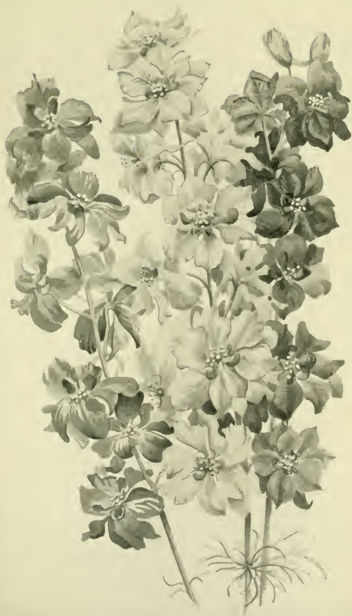
LARKSPUR ( Delphinium ajacis ).