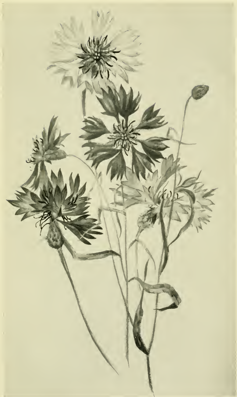
CORN FLOWERS ( Centaurea cyanus ).