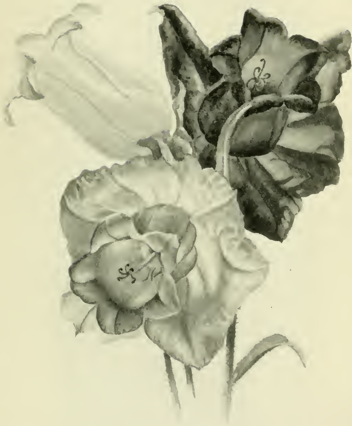
THE CUP AND SAUCER CANTERBURY BELLS ( Campanula medium calycanthema ).