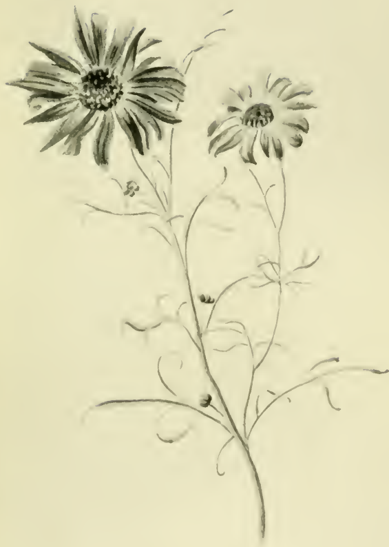
THE SWAN RIVER DAISY ( Brachycome iberidifolia ).