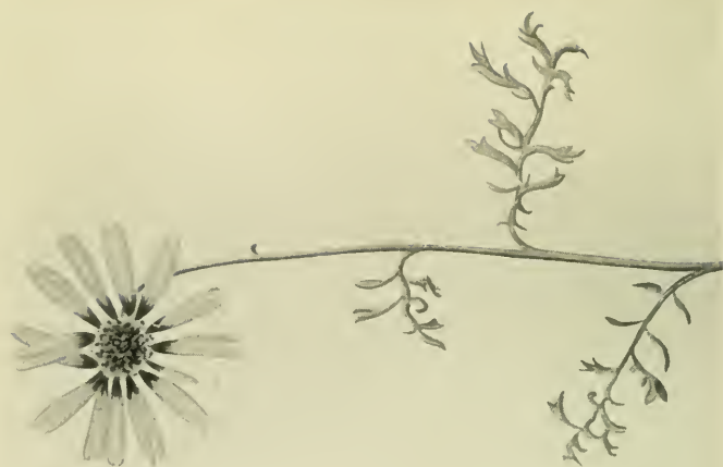
See p. 234.] SPHENOGYNE SPECIOSA.