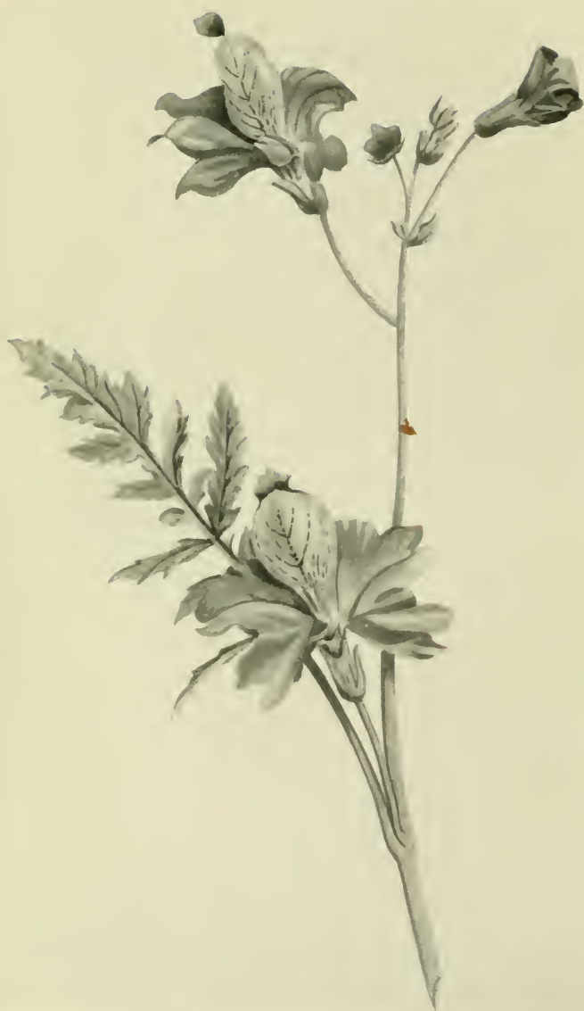
THE NOTCHED FRINGE FLOWER ( Schizanthus retusus ).