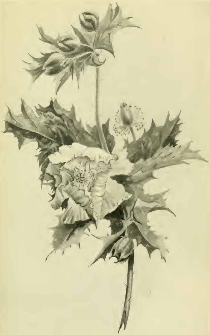
THE PRICKLY POPPY ( Argemone grandiflora ).