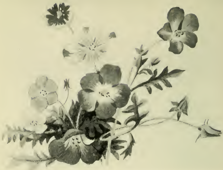
NEMOPHILA INSIGNIS , and Varieties.