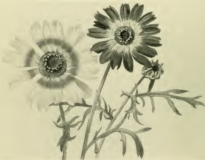
CHRYSANTHEMUM CARINATUM BURRIDGEANUM and CHRYSANTHEMUM CARINATUM ATROCOCINEUM.