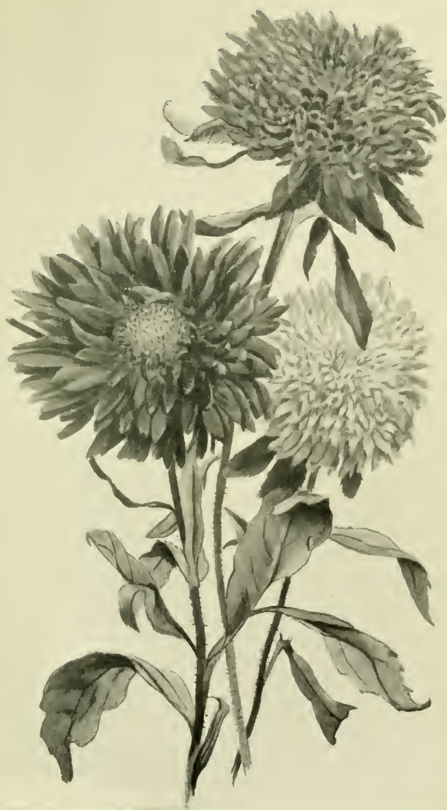
CHINA ASTER ( Callistephus chinensis ).