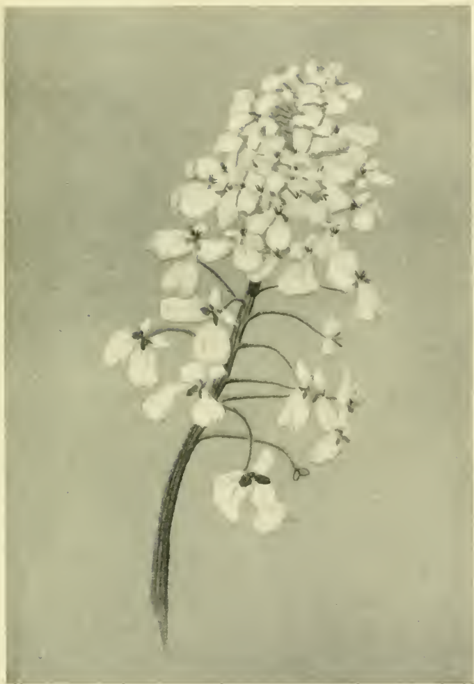
ROCKET CANDYTUFT ( Iberis coronaria ).