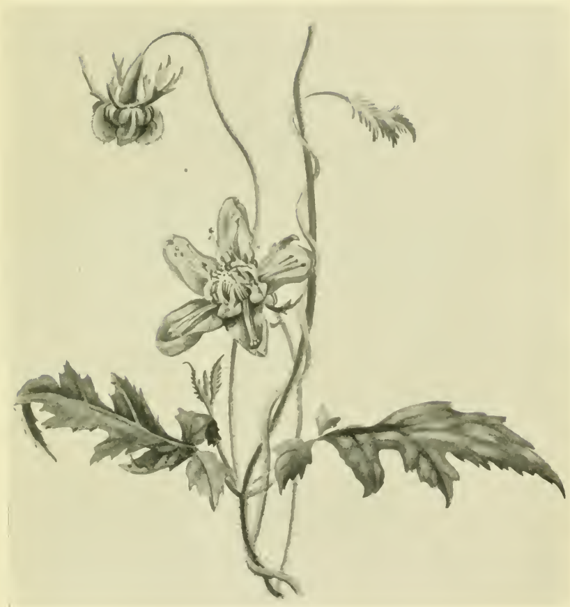
CHILI NETTLE ( Loasa aurantiaca ).