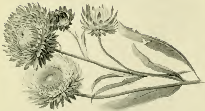
EVERLASTING FLOWER ( Helianthus monstrosum ).