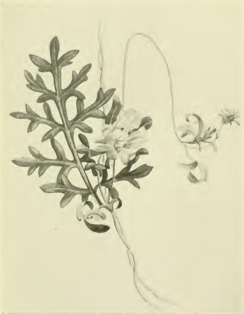
CUP FLOWER ( Seyphanthus elegans ).