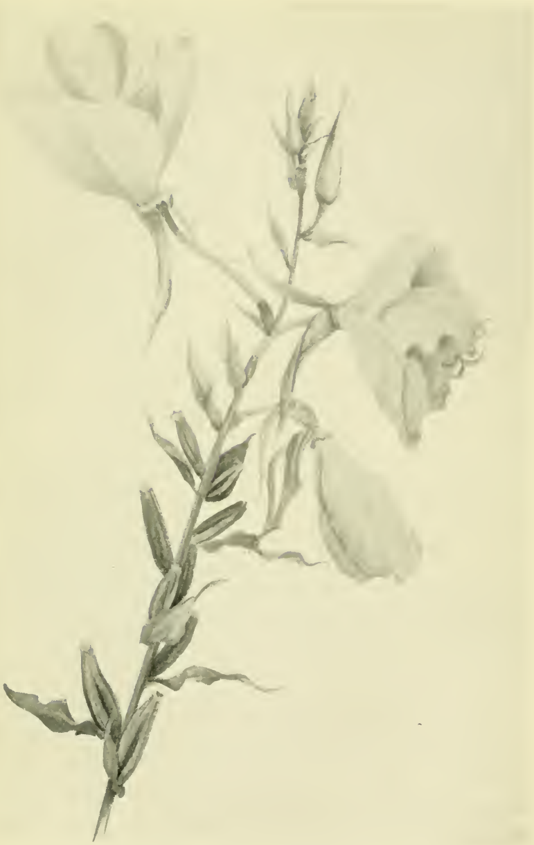
EVENING PRIMROSE ( Enothera biennis ).