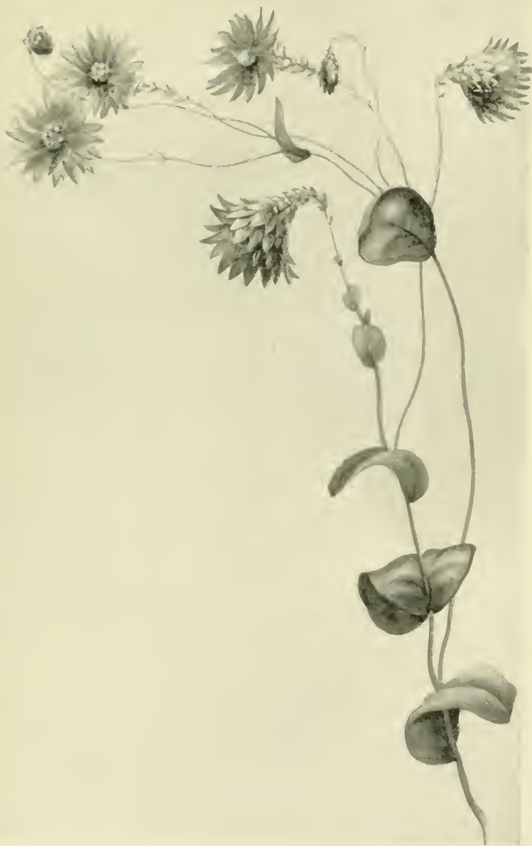
THE PINK ROSETTE OR SWAN RIVER EVERLASTING ( Rhodanthe manglesii ).