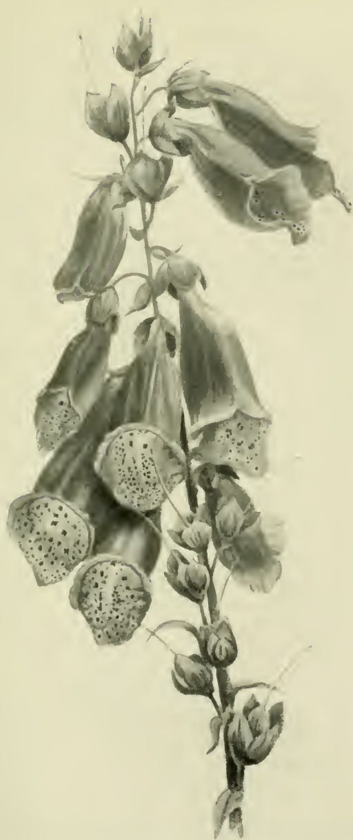
FOXGLOVE ( Digitalis purpurea ).