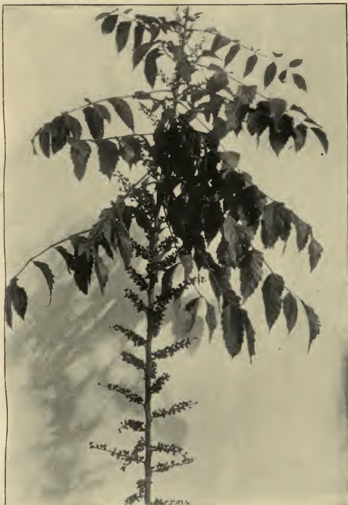
Brucea Sumatrana , Wall.