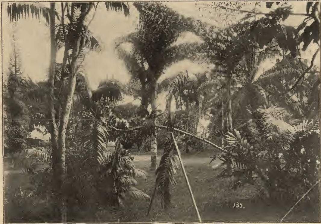
Malacca Cane ( Calamus Scipionum ) Lour.