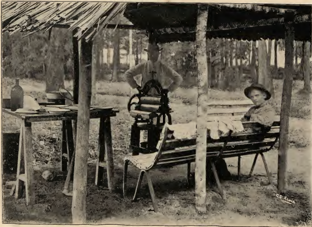
Rubber-preparing Shed, Botanic Gardens, Singapore.