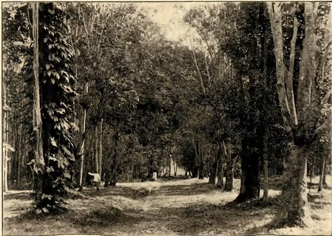
Para Rubber in the Botanic Gardens, Singapore.