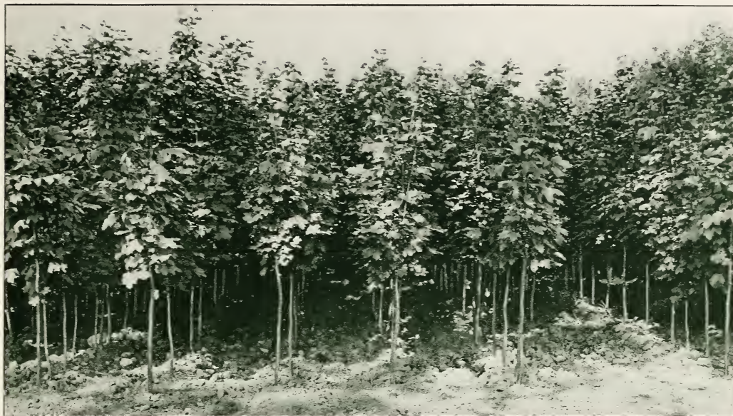
Norway Maples at Newark. Photographed August 7, 1929