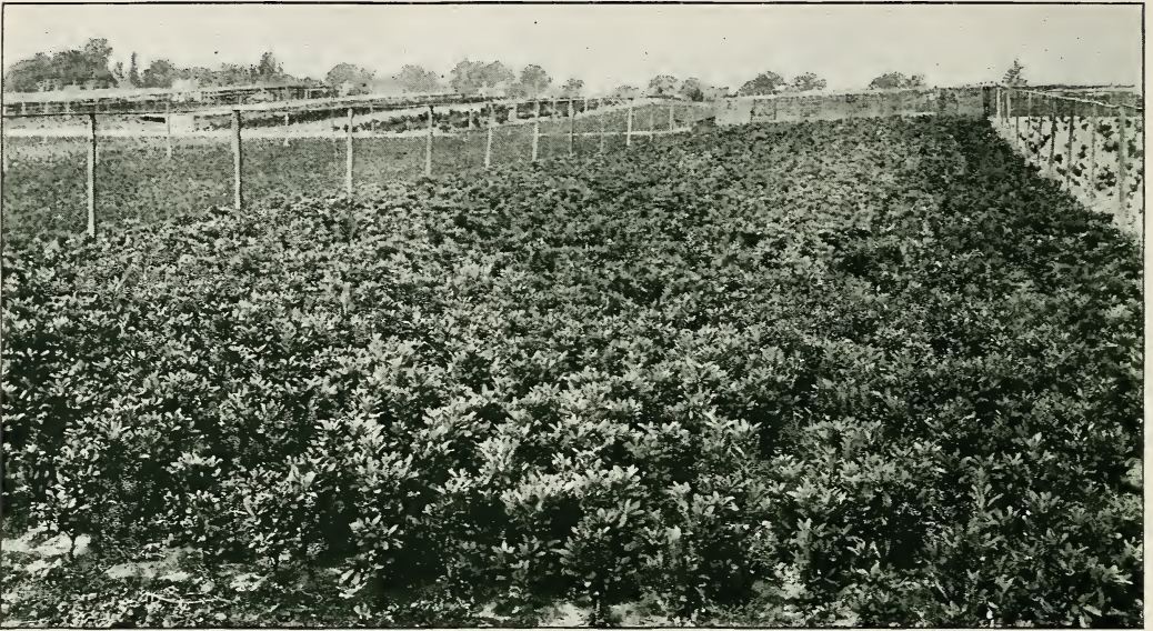
A small block of Azalea mollis . Photographed at Shiloh this summer