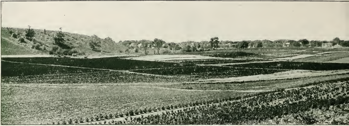
A general view of our new Seedling and Evergreen Department.