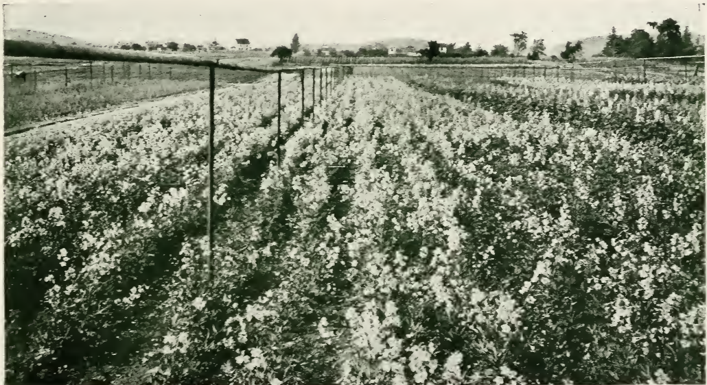
A part of our Delphiniums. Note the growth and bloom, the result of ideal conditions

The wholesale prices in our lists apply on wholesale quantities. Orders should call for 10 of a kind and size and beyond that for multiples of 10