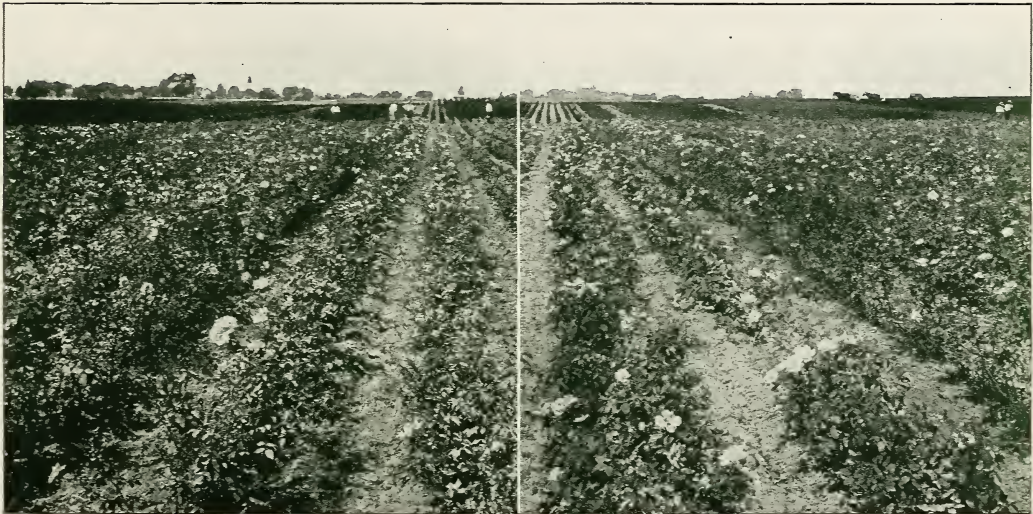
More New Jersey Roses. Left to right: Rudolph Kluis, Golden Emblem, Lady Pirrie, Lady Ursula, Mrs. C. W. Edwards, Robert Huey, Grange Colombe. Photographed July 30, 1929.