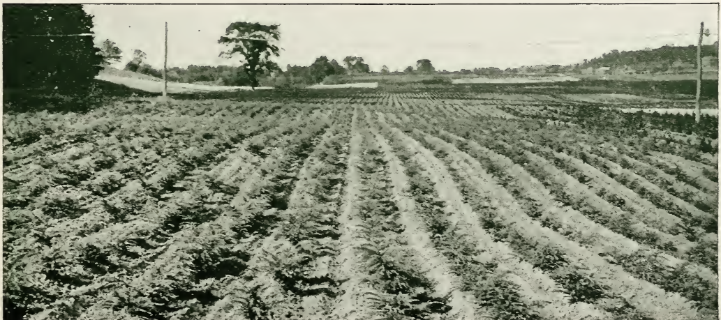
A small field of Canadian Hemlock showing Junipers and Arborvitæ in the background