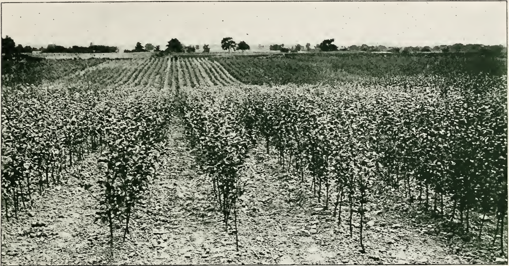
Standard Apples, two-year buds. Photographed August 7, 1929