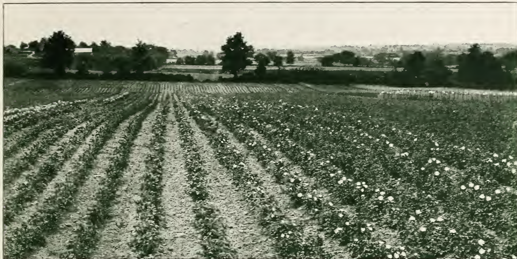
One end of our Newark Block of Roses showing Hybrid Teas. The plants are very good, and larger than they appear. Photographed from an elevation