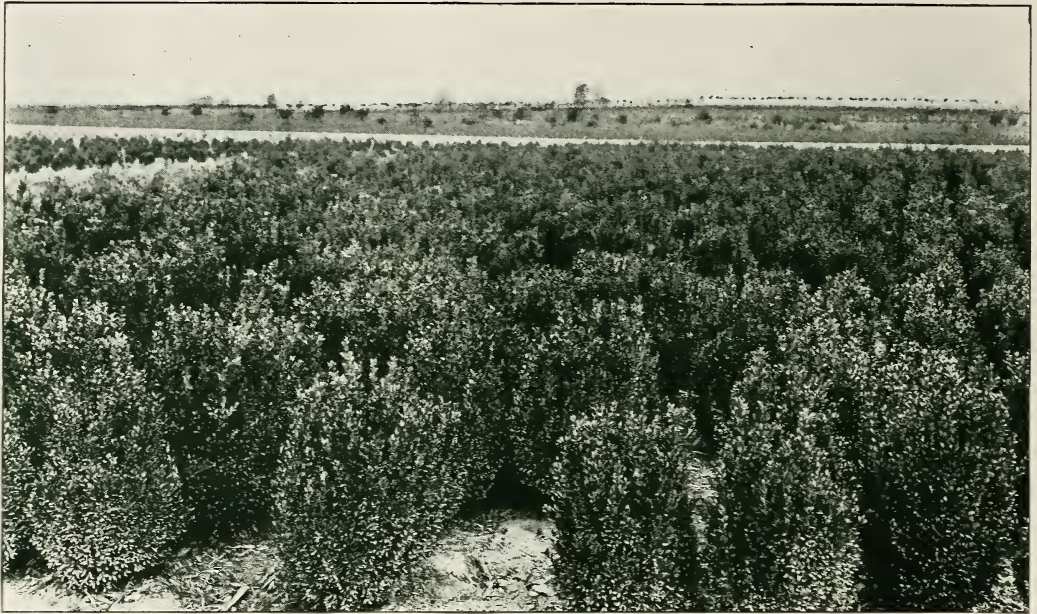
A part of our block of Buxus sempervirens at Shiloh