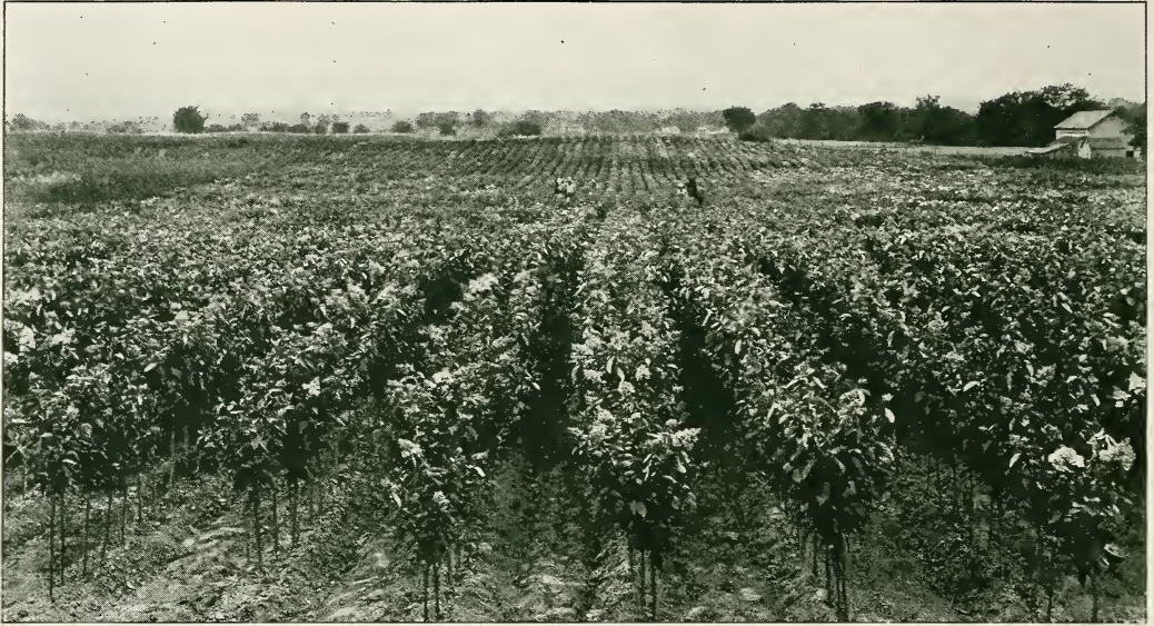
Our 1929 block of Tree Hydrangeas with fat stems and bushy, well-balanced tops