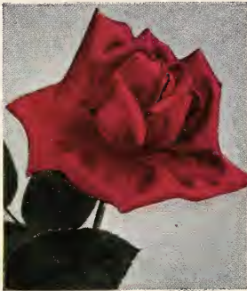
Etoile de France

A GROUP of Hybrid Tea Roses selected for range of color, thriftiness, beauty, and adaptability to all parts of the country. They have been carefully chosen from a large collection of varieties as best worthy of maintaining the high standard set by the "J. & P. Preferred" Dozens of former years. Ready in autumn 1929 and spring 1930.