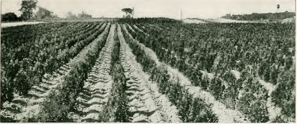
Pyramidal Arborvitæ at Newark, well sheared