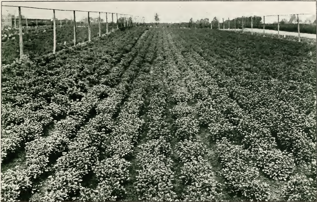
Azalea hinodegiri at Shiloh. Photographed July 30, 1929 Note particularly the vigorous growth and the special care taken in their culture