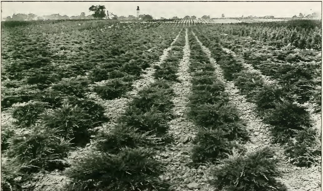
Evergreens, a leading specialty at our Shiloh branch This photograph, taken July 30, 1929, shows Pfitzer's Juniper well spaced and properly grown