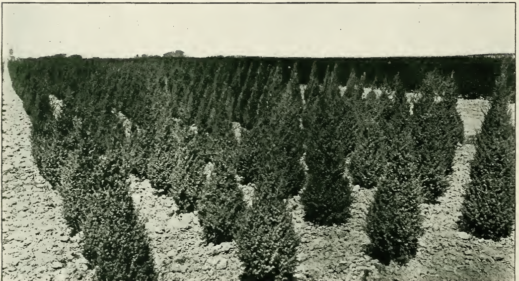
Juniperus columnaris . Photographed at Shiloh, July 30, 1929