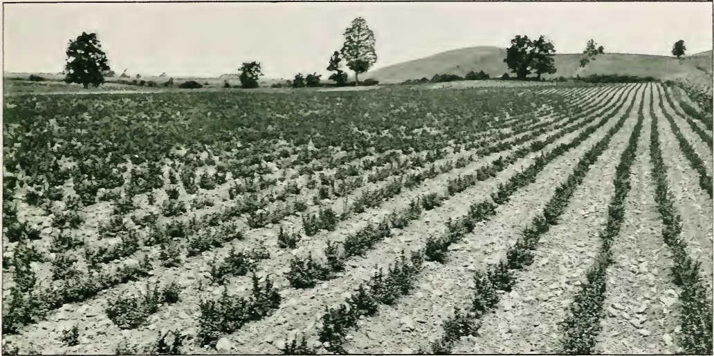
One of our fields of Red-leaved Japan Barberry