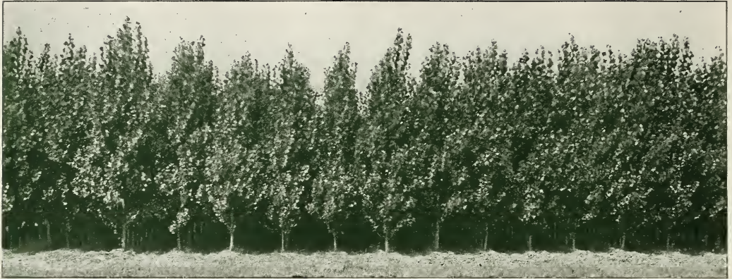
Lombardy Poplars, grown carefully and properly, well branched. Photographed August 7, 1929