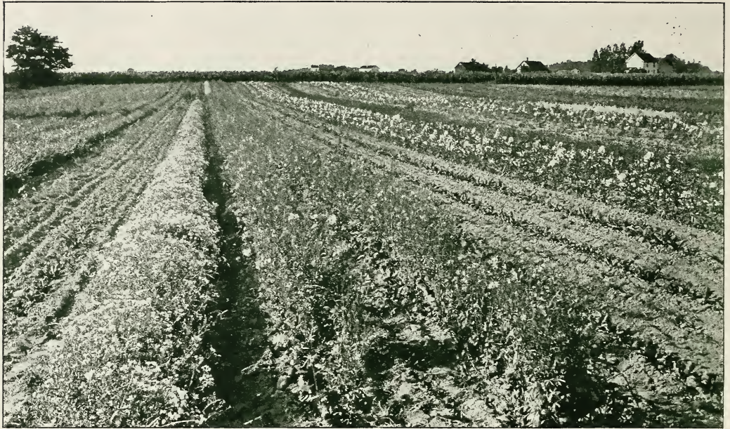
A part of our 1929 Perennial Block