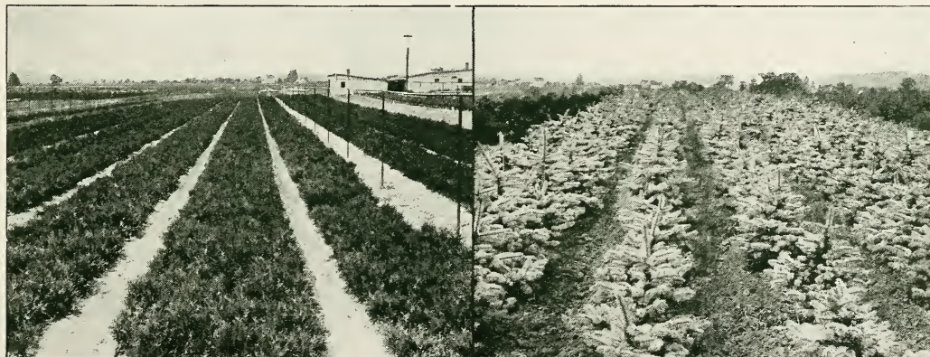
Left. Bedded Evergreens at Newark, showing American Arborvitae. 3-yr. T. Right. Block of Koster's Blue Spruce at Newark.