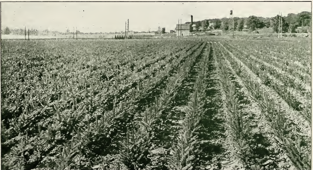
Transplanted Norway Spruce. Photographed August 7, 1929