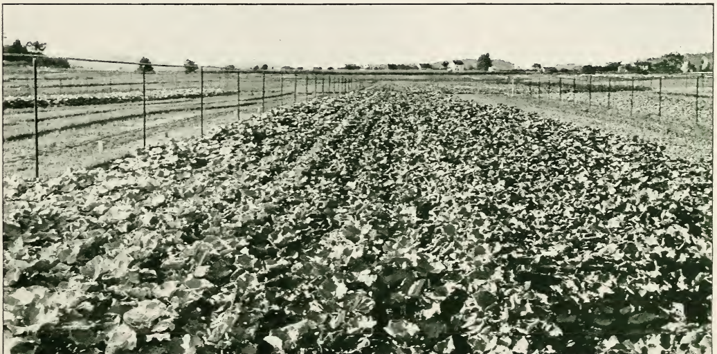
Double Hollyhocks in our Perennial Department. Photographed August 7, 1929