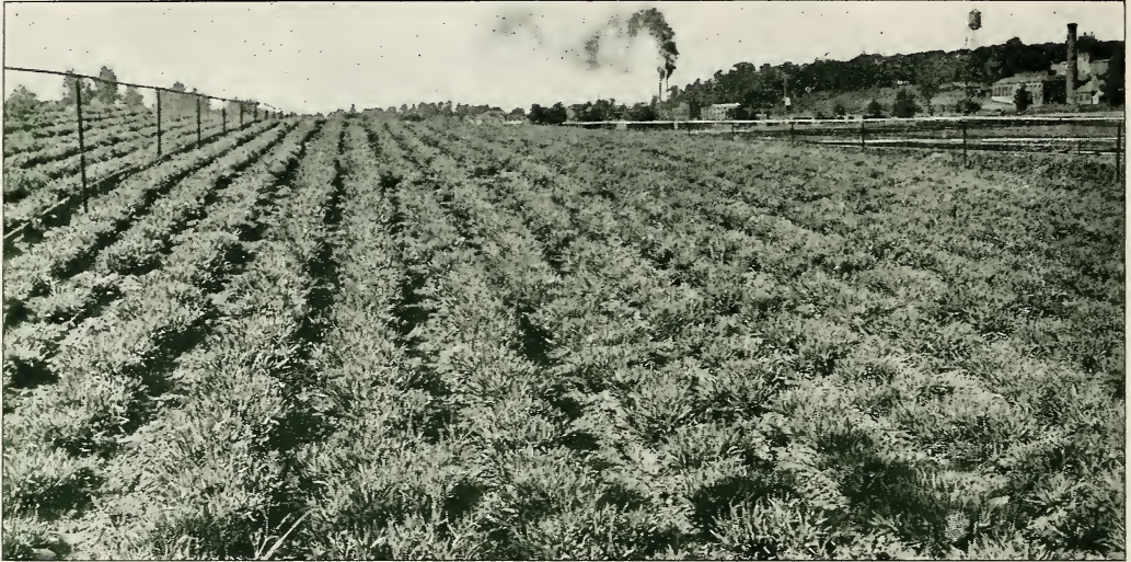
Field of Gypsophila, Bristol Fairy, the improved double Baby's Breath