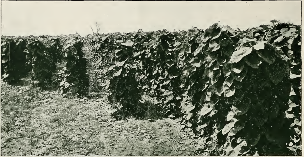
Dutchman's Pipe at Newark. Real he plants. True Aristolochia siphon