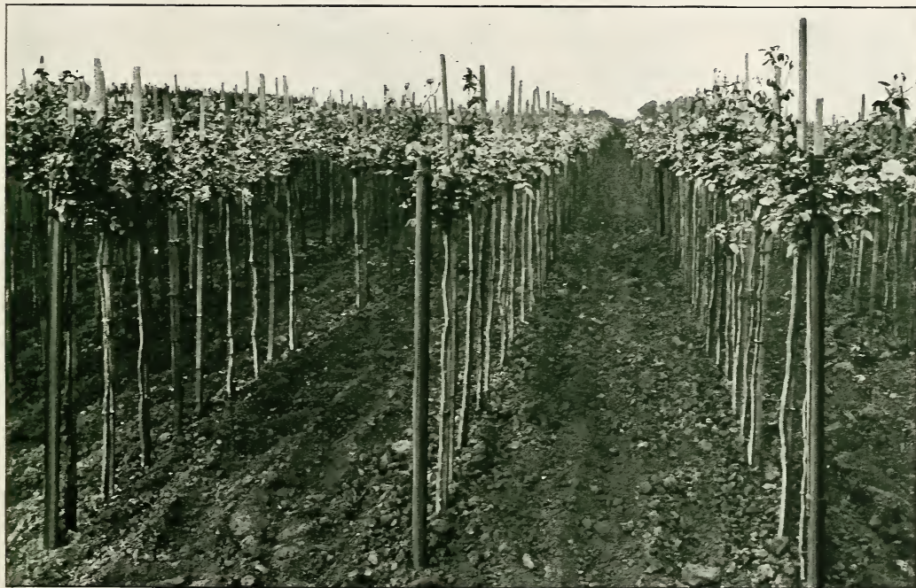
Standard or Tree Roses at Shiloh. Strong, sturdy stems with well-balanced heads. Photographed July 30, 1929