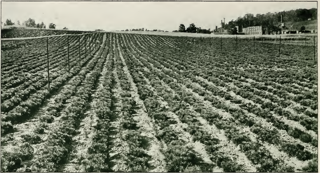
Block of Mugho Pines, a very dwarf strain. Seed from the high Alps. Photographed August 7, 1929