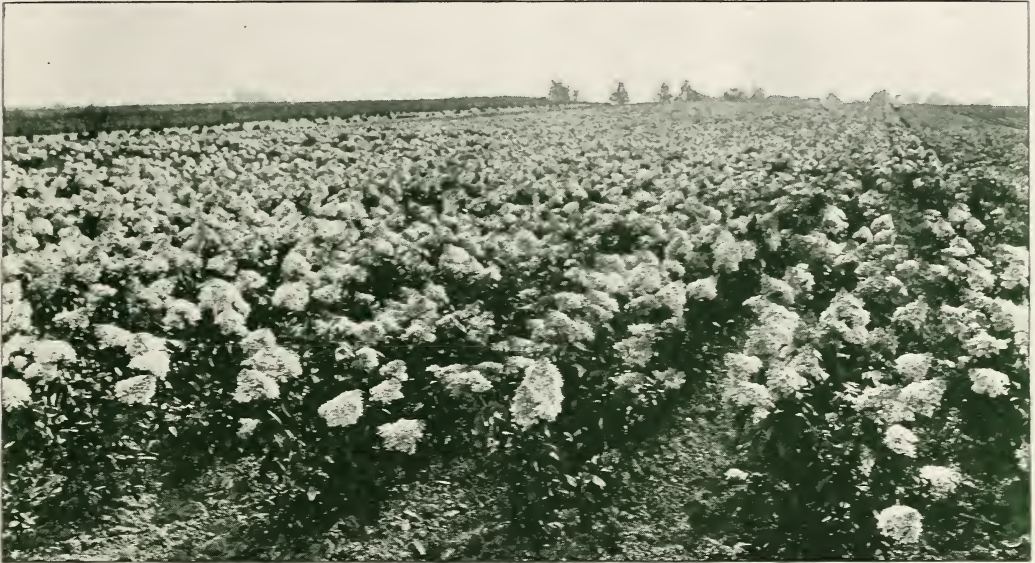
Hydrangea P. G. does particularly well at our New Jersey Branch This photograph was taken July 30, 1929