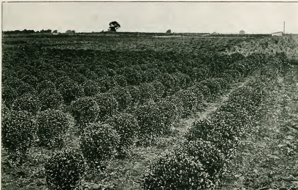
Ball-shaped California Privet in the foreground; Pfitzer's Juniper and Cedrus deodara in the background. At Shiloh