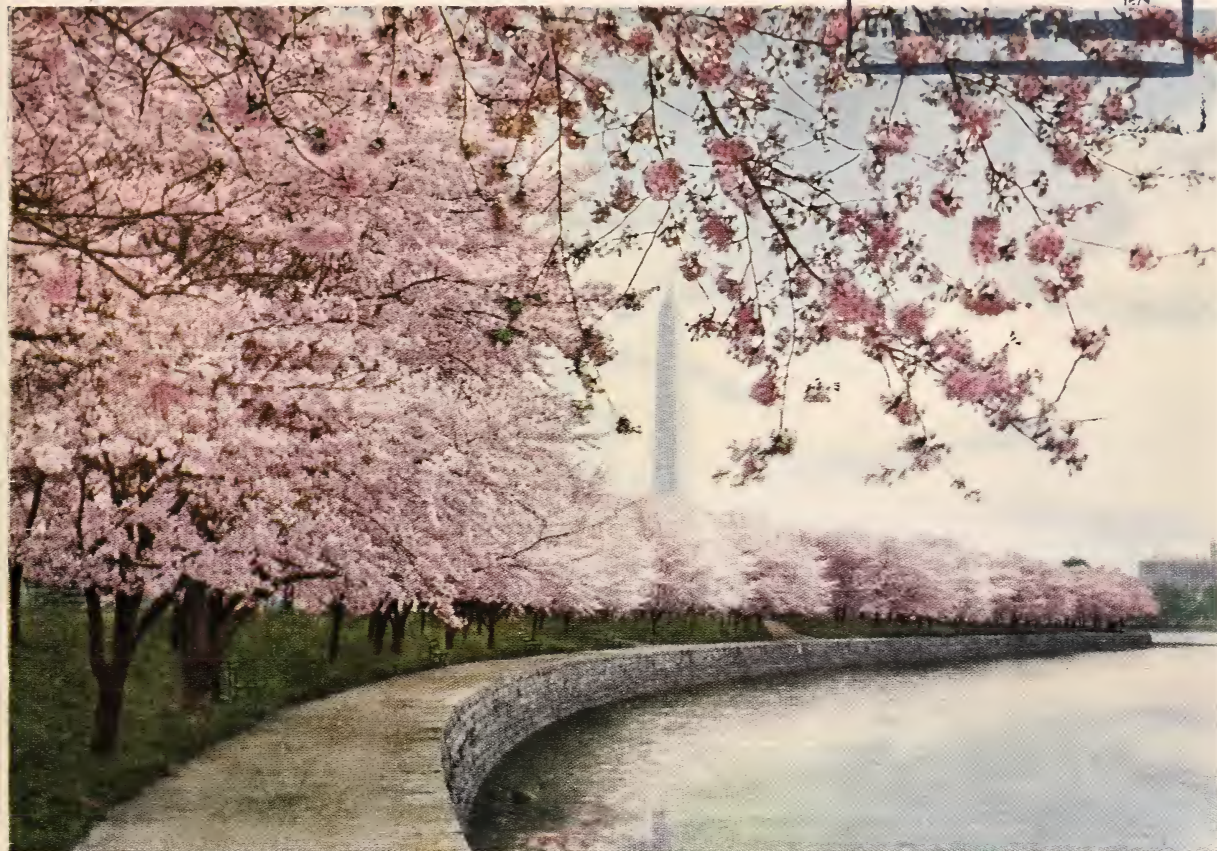
"YOSHINO" (Yedoensis) on the Tidal Basin