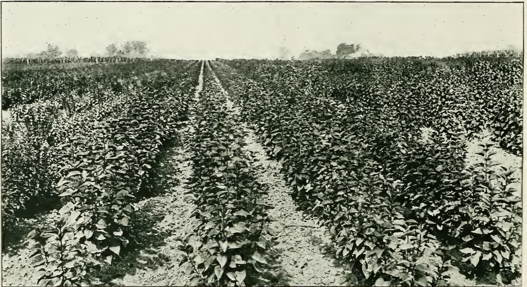
French Lilacs do especially well at our New Jersey Branch. This photograph, made July 30, 1929, shows a part of one of our blocks

Stock offered on this page is from our New Jersey Branch