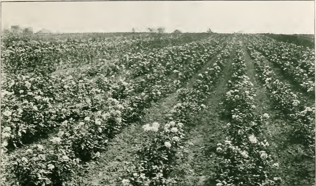
A part of our block of Hybrid Tea Roses at Shiloh showing Mrs. Aaron Ward. Photographed July 30, 1929