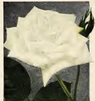
Kaiserin Auguste Viktoria