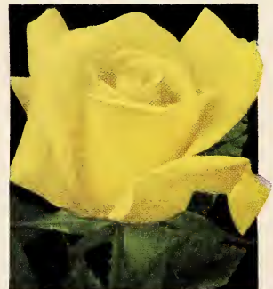
Souv. de Claudius Pernet

Copies of the color pictures of above dozen are available to our customers for sales promotion. Prices on application