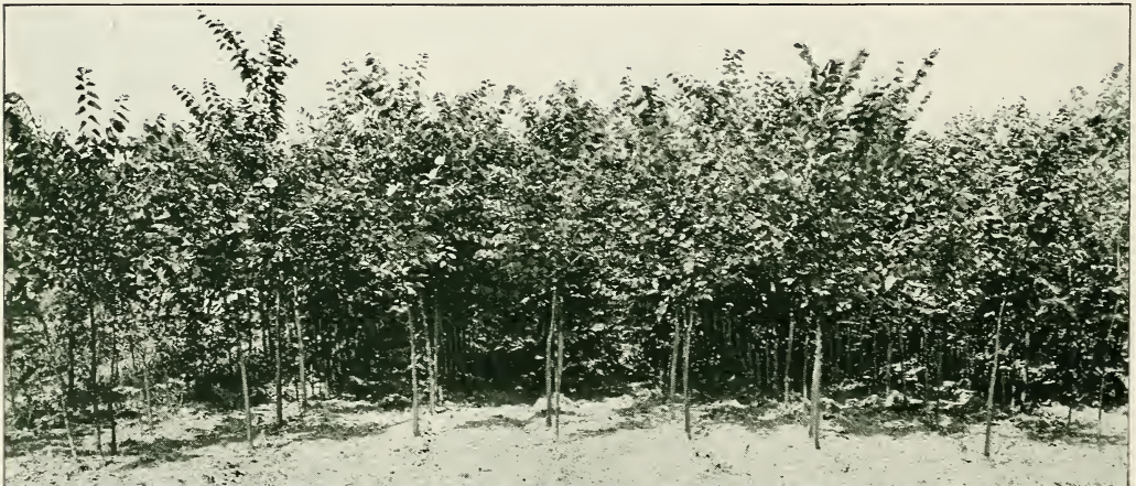
A block of young American Elms. Photographed at Newark this summer