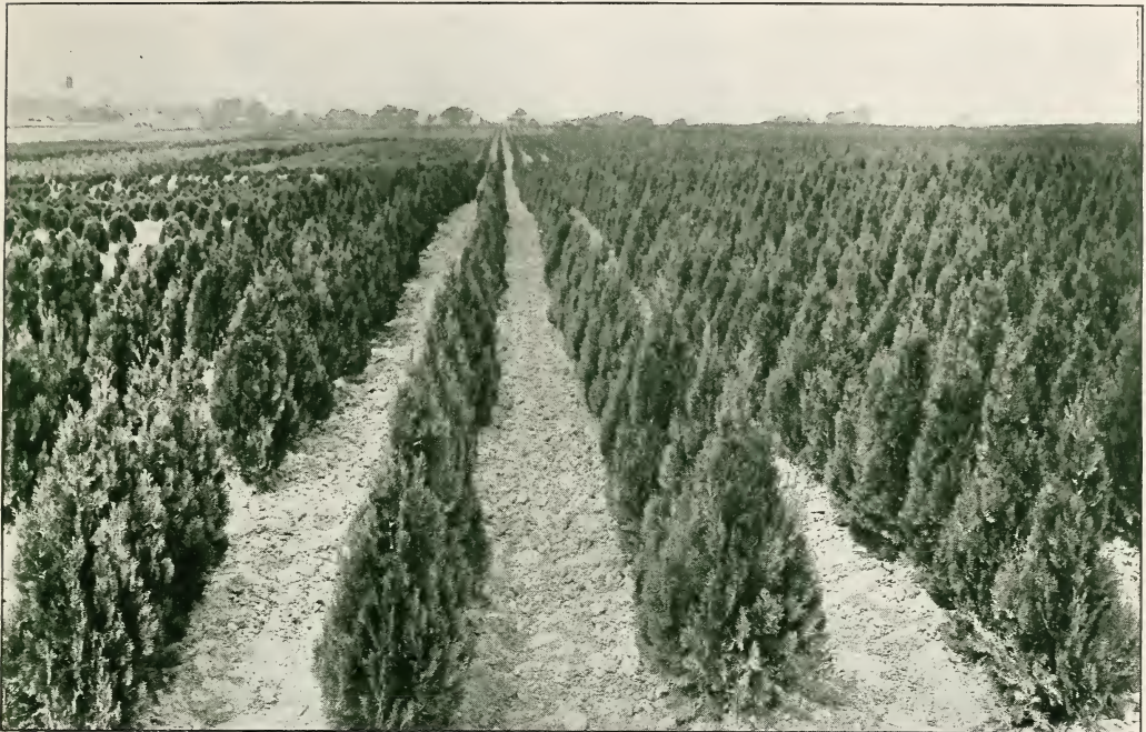
A block of Thuja elegantissima at Shiloh, transplanted and sheared. Photographed in late July