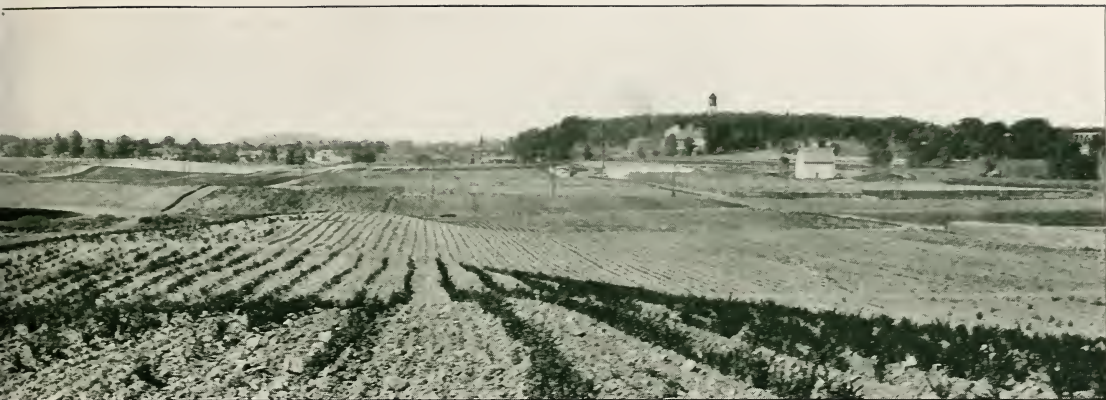
Photographed August 7, 1929