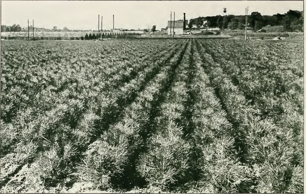
Austrian Pine, a Newark specialty. Photographed August 7, 1929