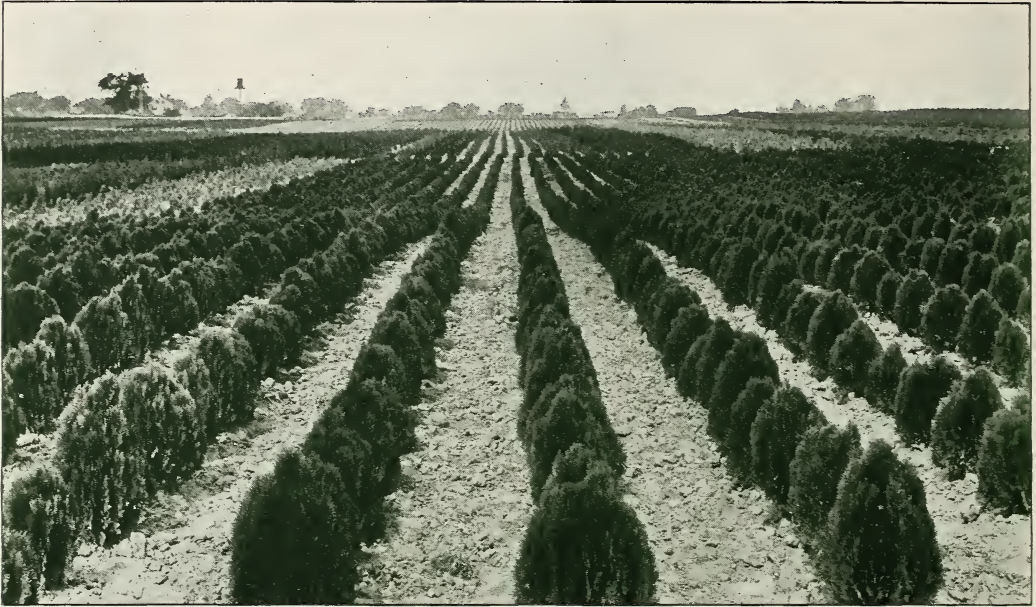
A fine, well-grown block of Berckman's Golden Arborvitæ ( Thuja orientalis aurea nana ) Photographed this summer at Shiloh