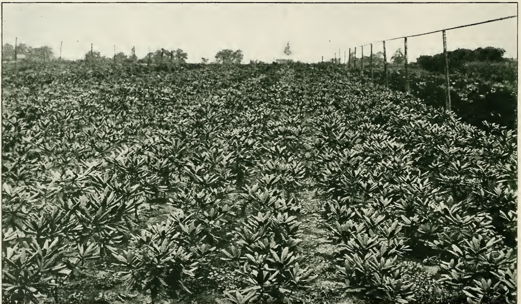
Hybrid Rhododendrons at Shiloh