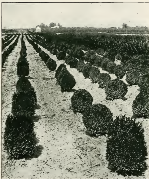
Formal shapes in Boxwood and Privet are becoming quite the vogue. We grow both at Shiloh in large quantities.

Stock offered on this page is from our New Jersey Branch