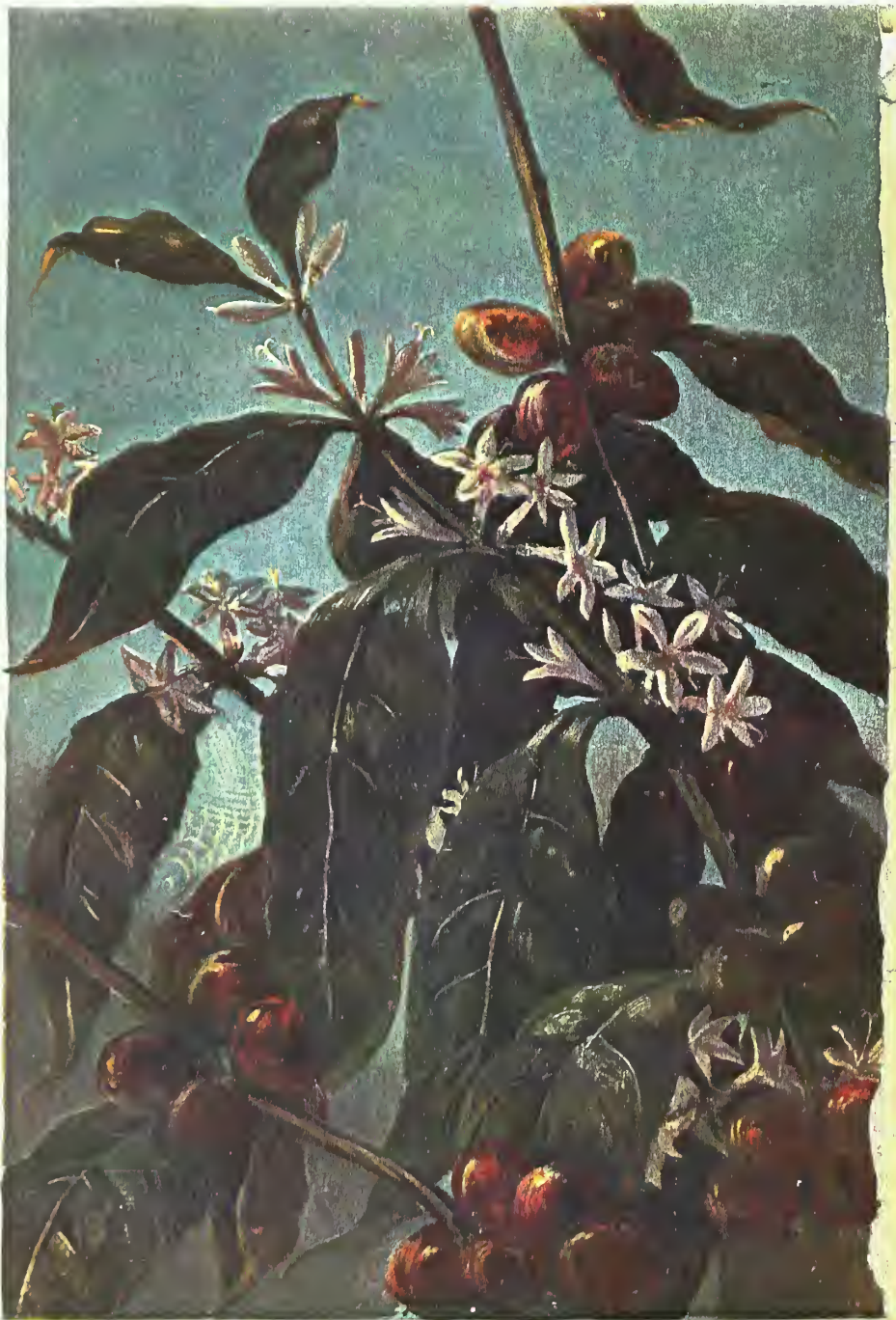
ENTERED ACCORDING TO ACT OF CONGRESS, A. D. 1878 BY AUGUST HELMUTH IN THE OFFICE OF THE LIBRARIAN OF CONGRESS AT WASHINGTON, D. C.