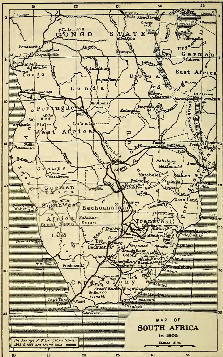
S. AFRICA IN 1905, WITH LIVINGSTONE'S TRAVELS IN 1849-1856 TRACED ON IT.