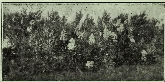
Yucca Aloefolia in bloom along Galveston Highway