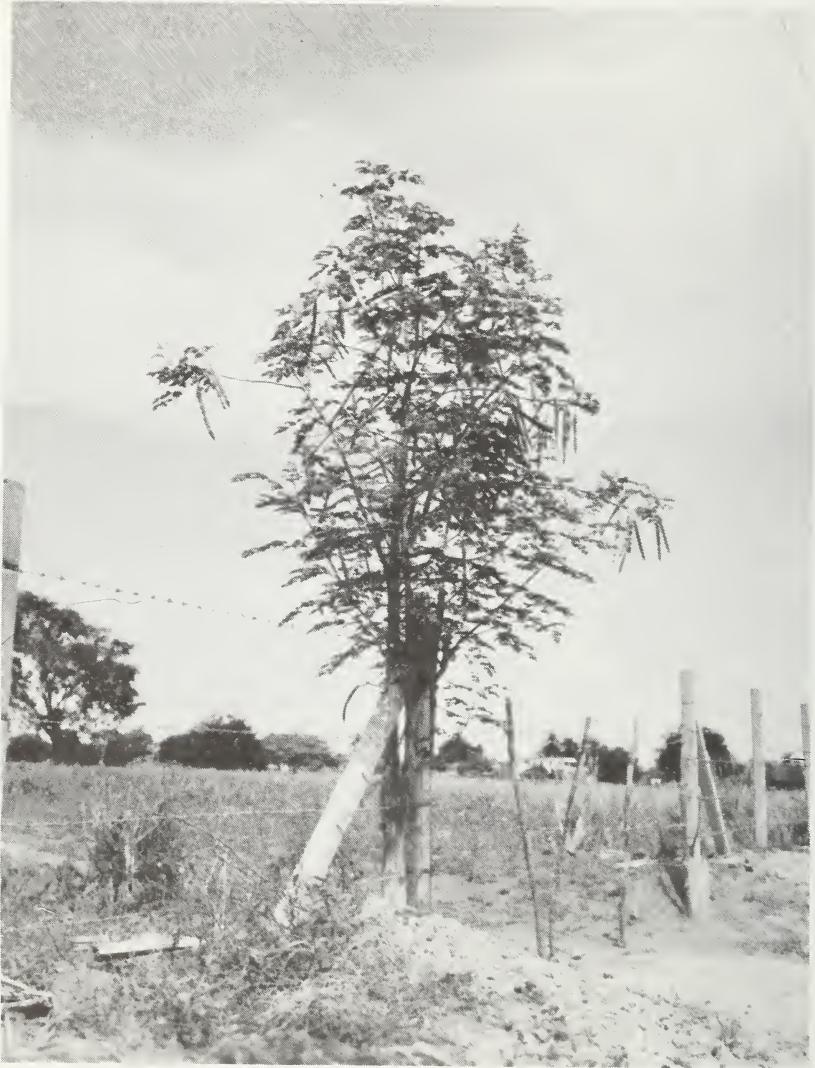
Figure 31.—Mature trees of Moringa oleifera , the horseradish tree.