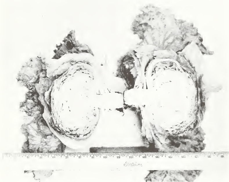
Figure 41.—Head lettuce grown at a medium elevation in the tropics, showing a semi-solid head.