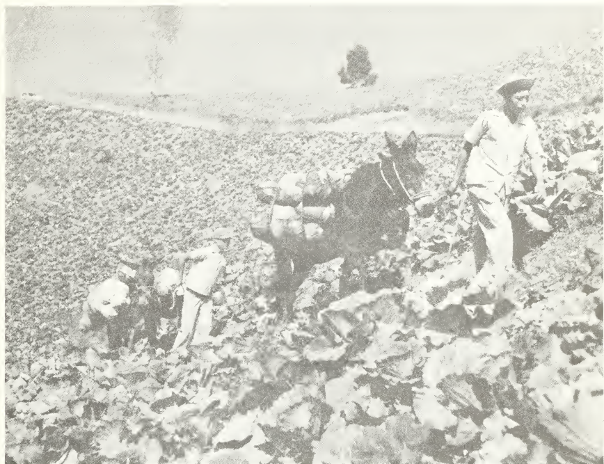
Figure 37.—Harvest time, and the most reliable way of getting cabbages out of the field.