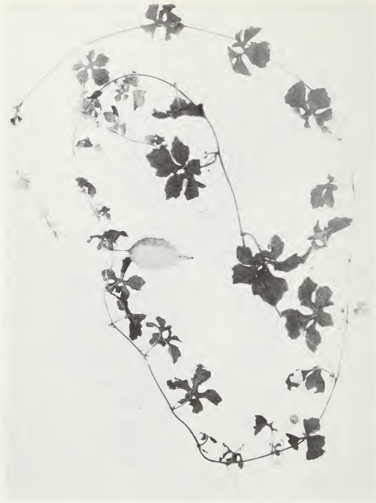
Figure 23.—Leaves and mature fruit of the wild balsam pear, Momordica charantia .