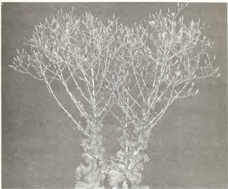
Figure 42.—Lettuce flowering.