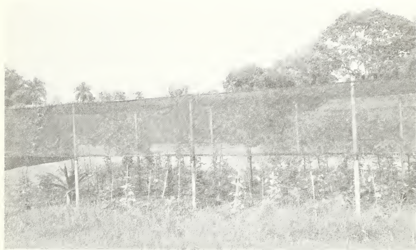
Figure 50.—A saran cloth shelter used to reduce light intensity and temperature.