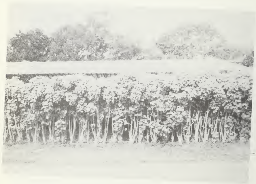
Figure 51.—A Panax hedge which reduces wind under the glass roof.