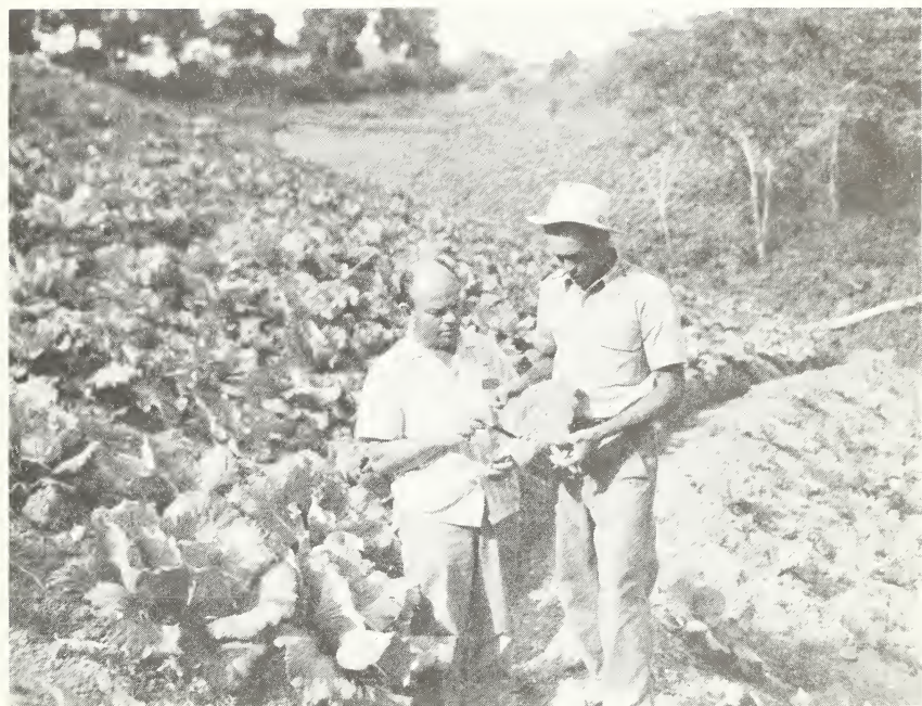
Figure 36.—A hillside planting of cabbage, established and cultivated by hand, in the mountains of Puerto Rico.