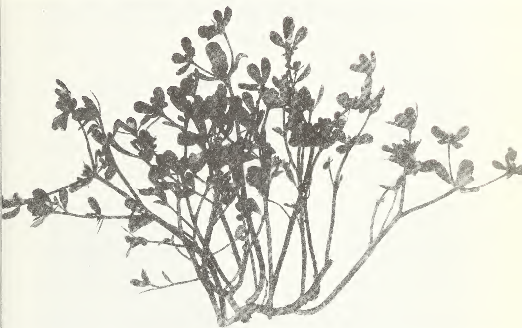
Figure 25.—An edible Portulaca from the fields of Puerto Rico.