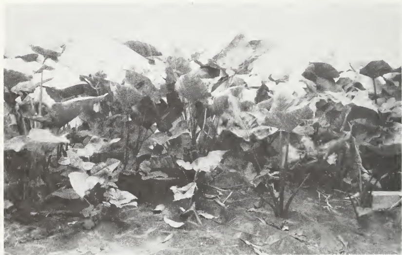
Figure 56.—Tahitian taro growing in a bed covered with plastic mulch.