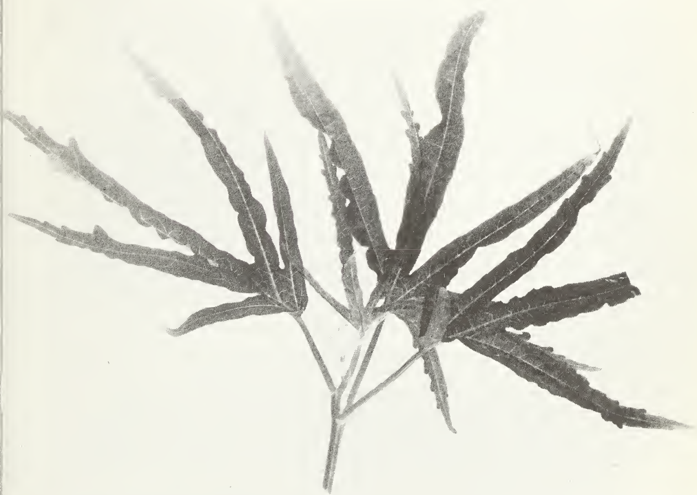
Figure 11.—The sulfur colored leaves of Hibiscus manihot .