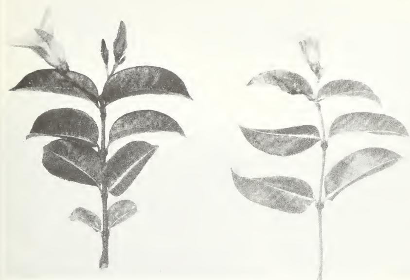
Figure 46.—Leaf and flower of Cryptostegia grandiflora , erroneously called the purple allamanda.