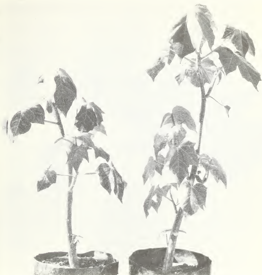
Figure 14.—Young plants from cuttings of Cnidoscolus chayamensis .