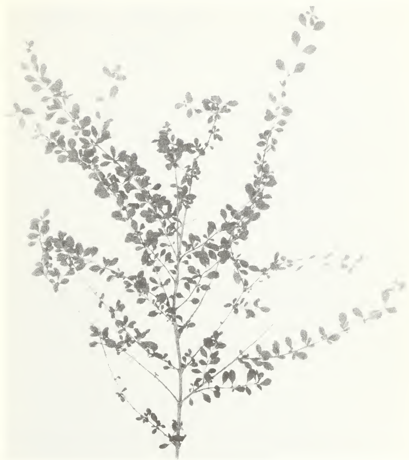
Figure 33.—The oregano of Puerto Rico, Lippia helleri .