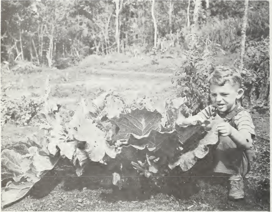
Figure 35.—Cabbage in a garden clearing in the Caribbean.