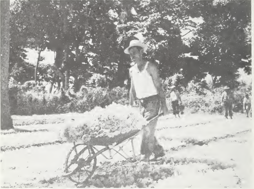
Figure 40.—Gardening for lettuce on a small commercial farm of Puerto Rico.