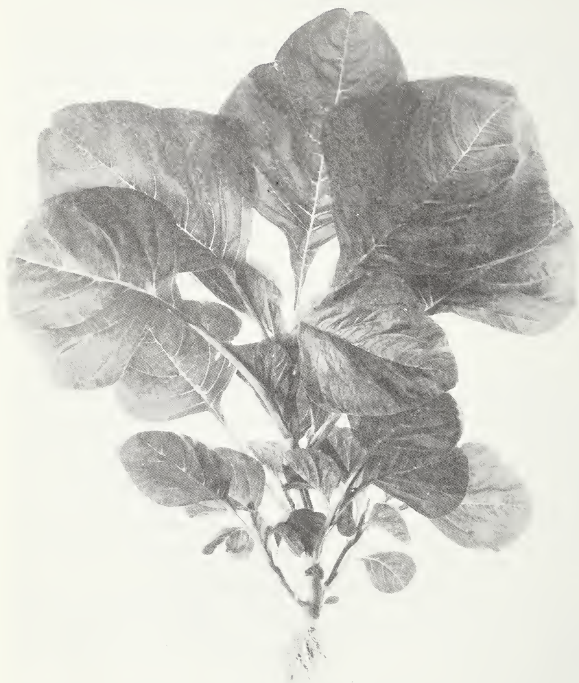
Figure 2.—A broad-leaved variety of edible amaranth.