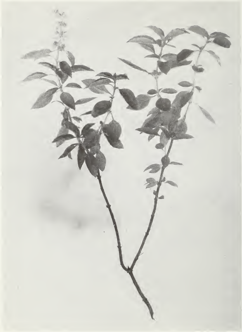
Figure 34.—Albahaca or basil, as grown for its leaves in Puerto Rico.