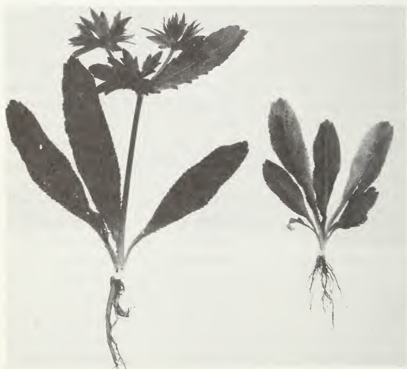
Figure 32.—Culantro, the false coriander of Puerto Rico, used for its spicy leaves.