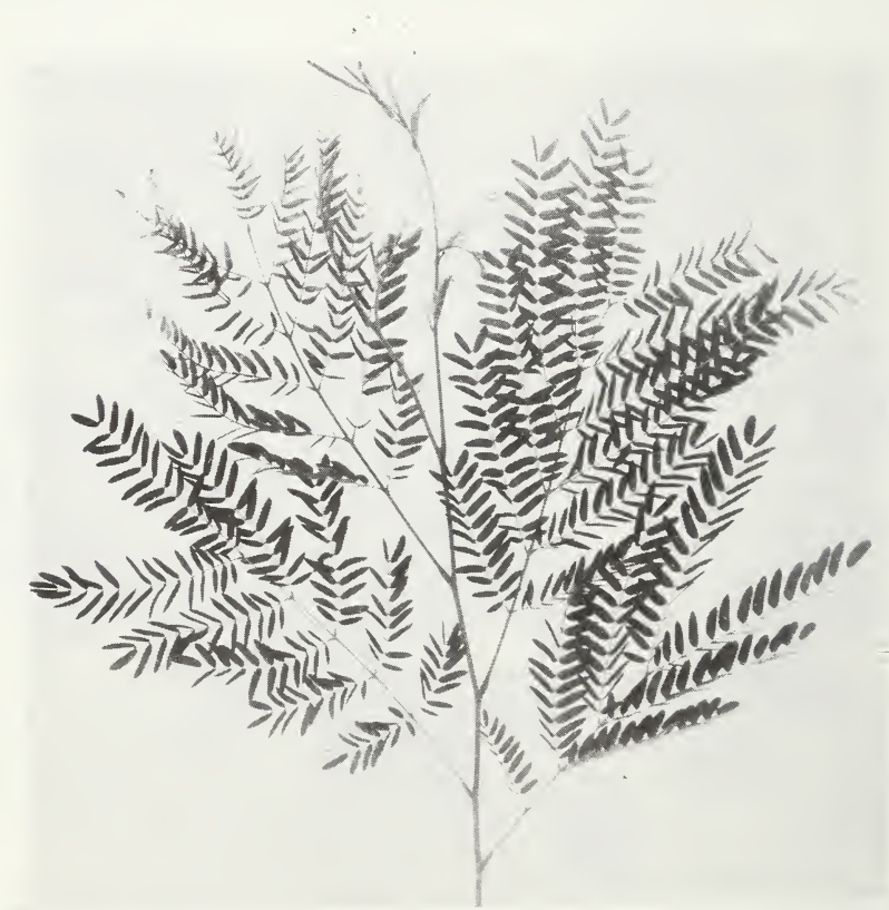
Figure 28.—The pinnate leaves of the weedy tree Leucaena leucocephala .