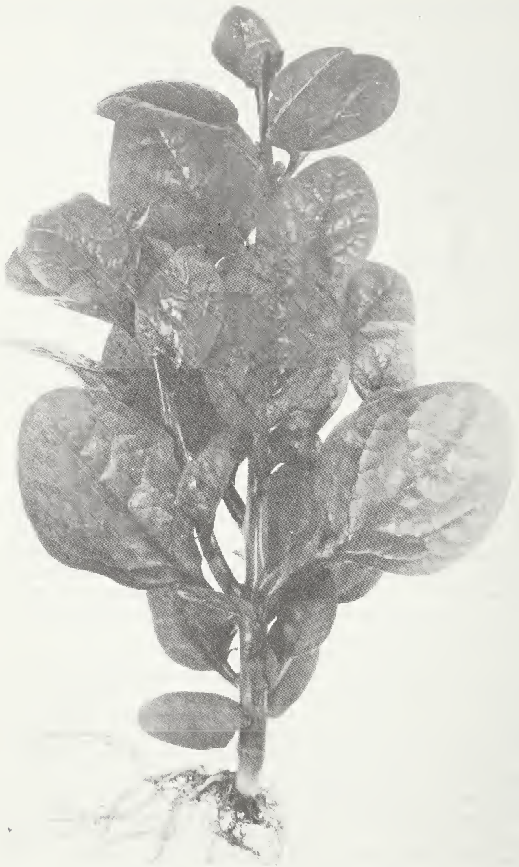
Figure 4.—Young plant of Basella rubra , Ceylon spinach.