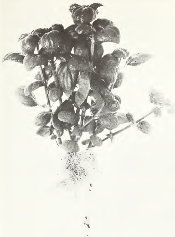
Figure 19.—A clump of the edible weed, Justicia insularis .