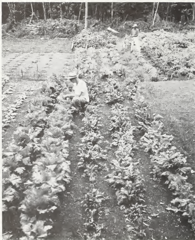
Figure 54.—Garden beds planted with many green-leaved vegetables.