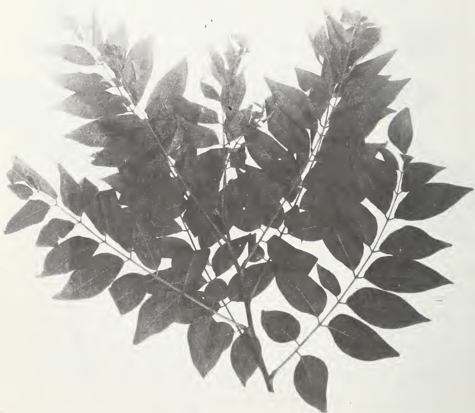
Figure 27.—The leaves of mother-of-cacao, Gliricidium sepium .