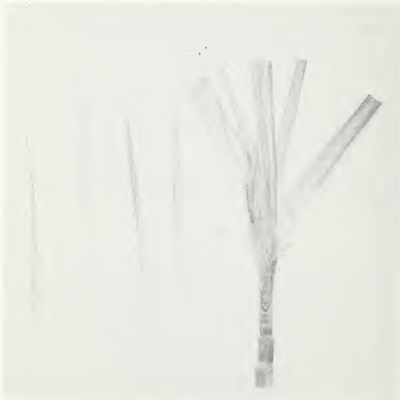
Figure 10.—The delicate edible inner leaves of corn.