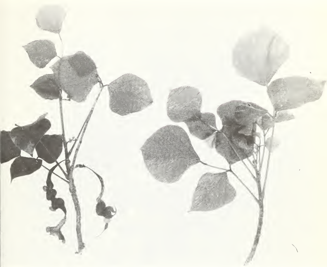
Figure 26.—Edible leaves and ripe pods of Erythrina berteroana , dwarf bucare.