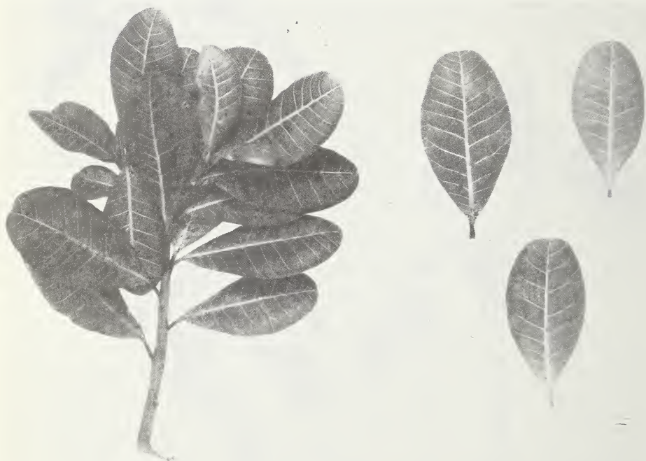
Figure 15.—Leaves of Anacardium occidentale , the cashew.