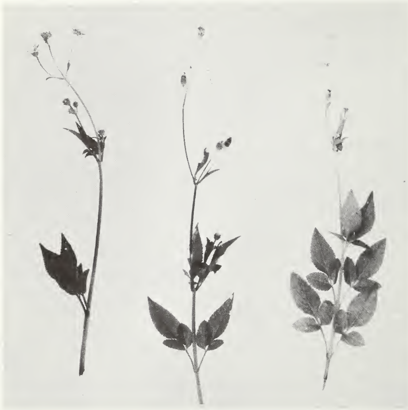
Figure 21.— Bidens pilosa , Spanish needles, is a widely distributed edible weed of the tropics.