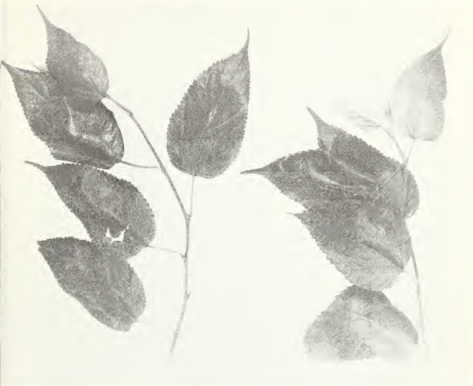
Figure 18.—Young leaves of the mulberry, Morus alba .