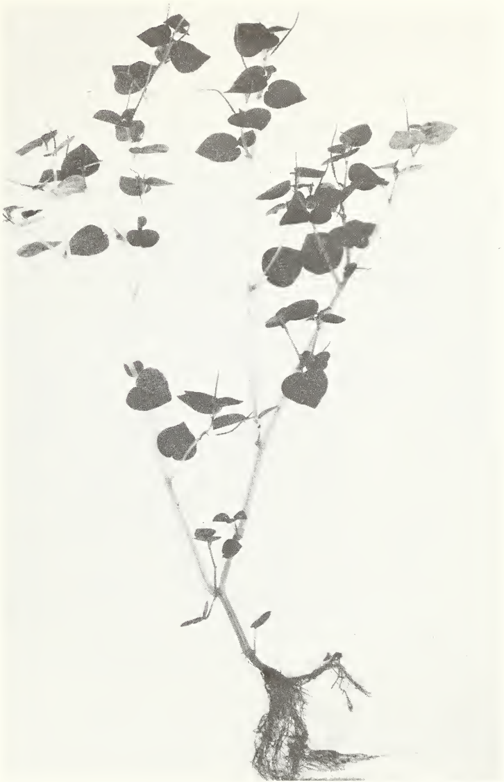
Figure 24.— Peperomia pellucida , a common edible weed of greenhouses.