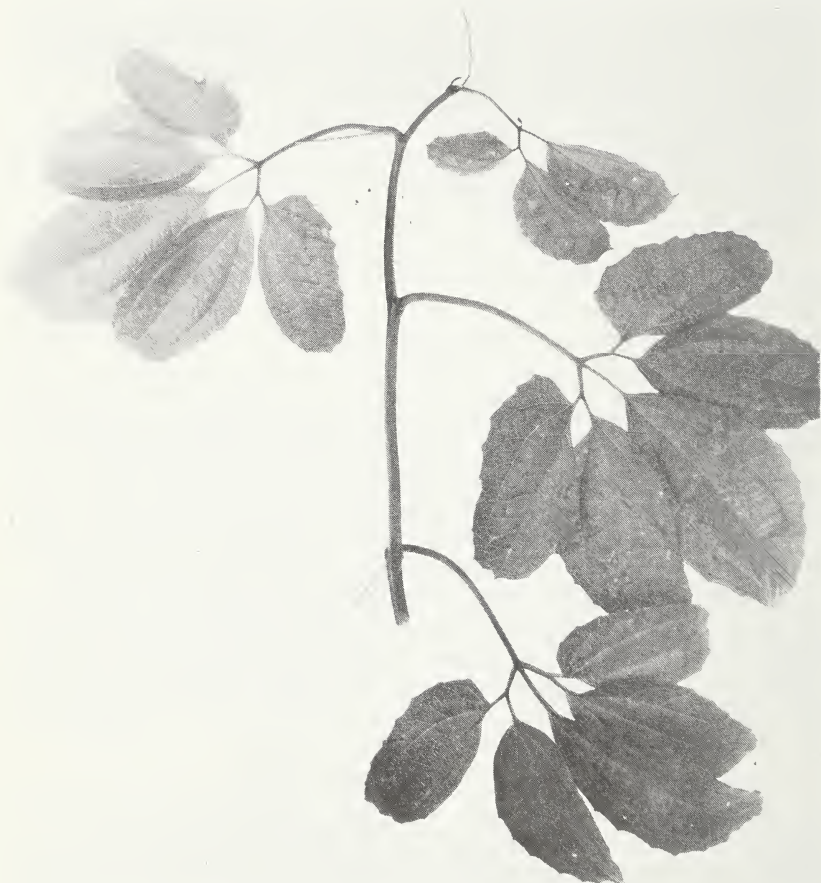
Figure 6.—The leaves of Telfaria occidentalis at about the stage they are marketed in West Africa.