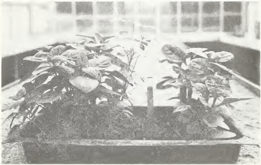
Figure 55.—Seedling flats of green-leaved vegetables.