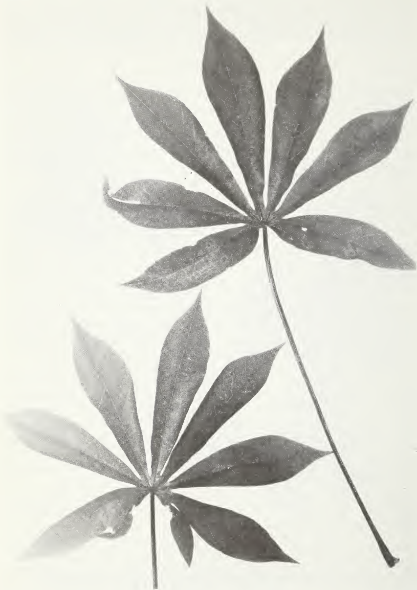
Figure 7.—Recently matured leaves of Manihot esculenta , cassava, at the stage for cooking.