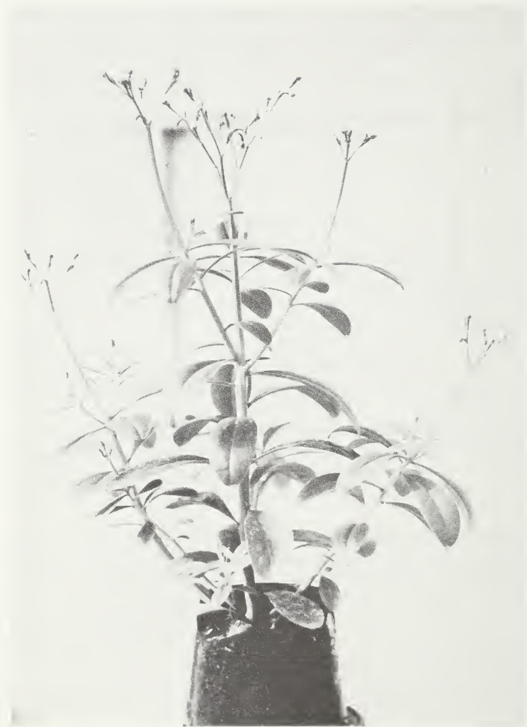
Figure 9.—Mature plant of Talinum triangulare .