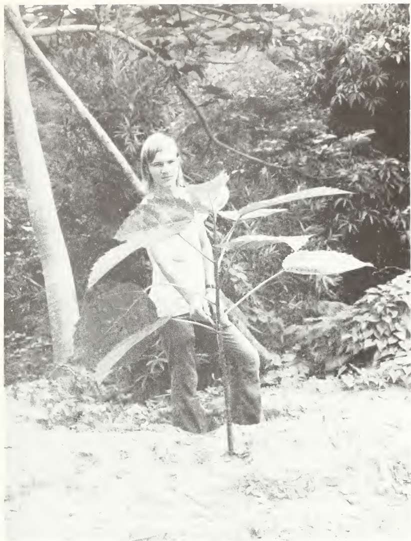
Figure 43.—Ortiga, Urera baccifera , a stinging nettle of the Caribbean.