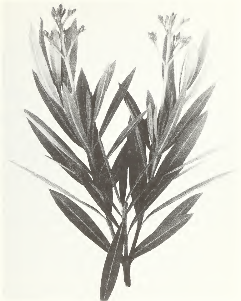
Figure 45.— Nerium oleander , one of the most dangerous of garden shrubs.