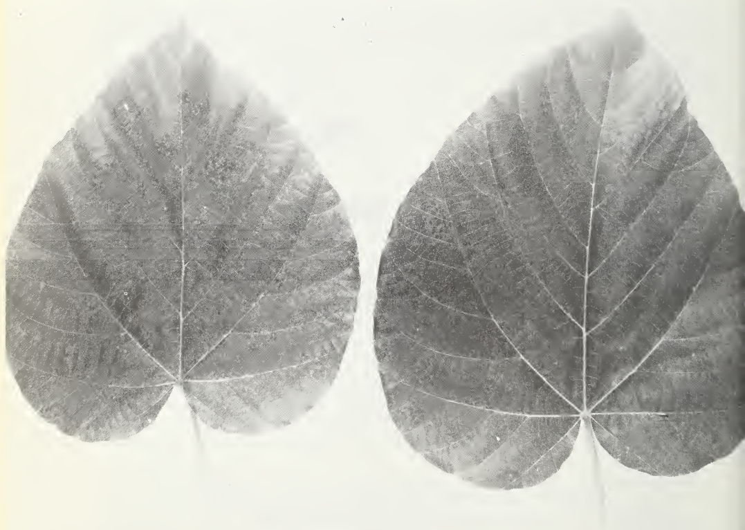
Figure 47.— Aleurites fordii , tung, the source of oil and poisonous leaves.