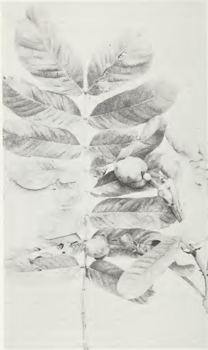
Figure 12.— Cassia alata , ringworm senna, a medicinal and edible leaf.