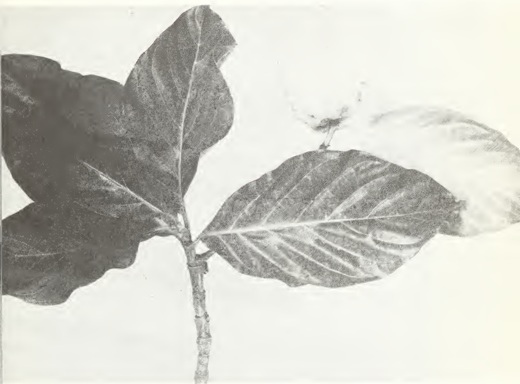
Figure 30.—Leaves and fruit of Morinda citrifolia .