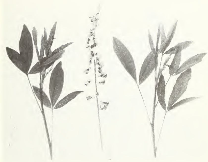
Figure 48.— Crotalaria retusa L.: its colorful flowers and poisonous leaves.