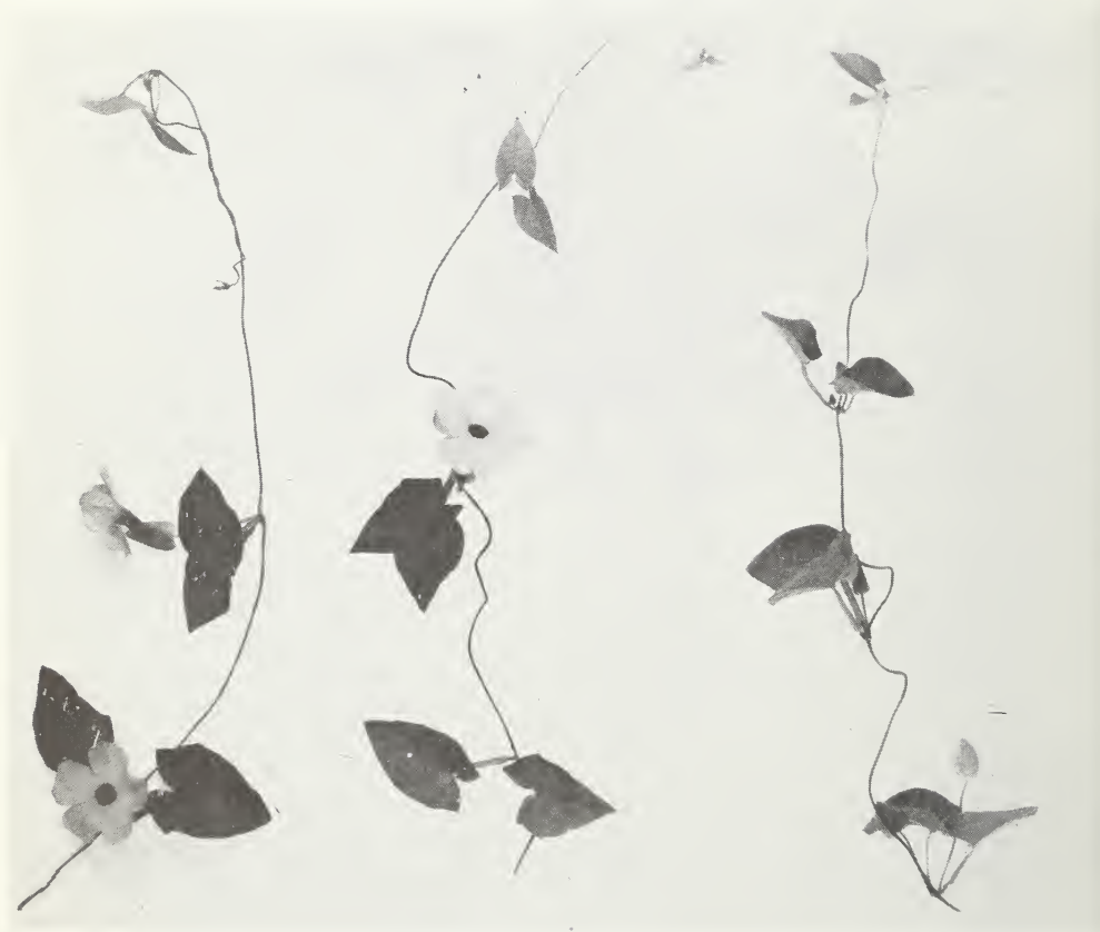
Figure 20.—Leaves and flowers of Thunbergia alata , susana .