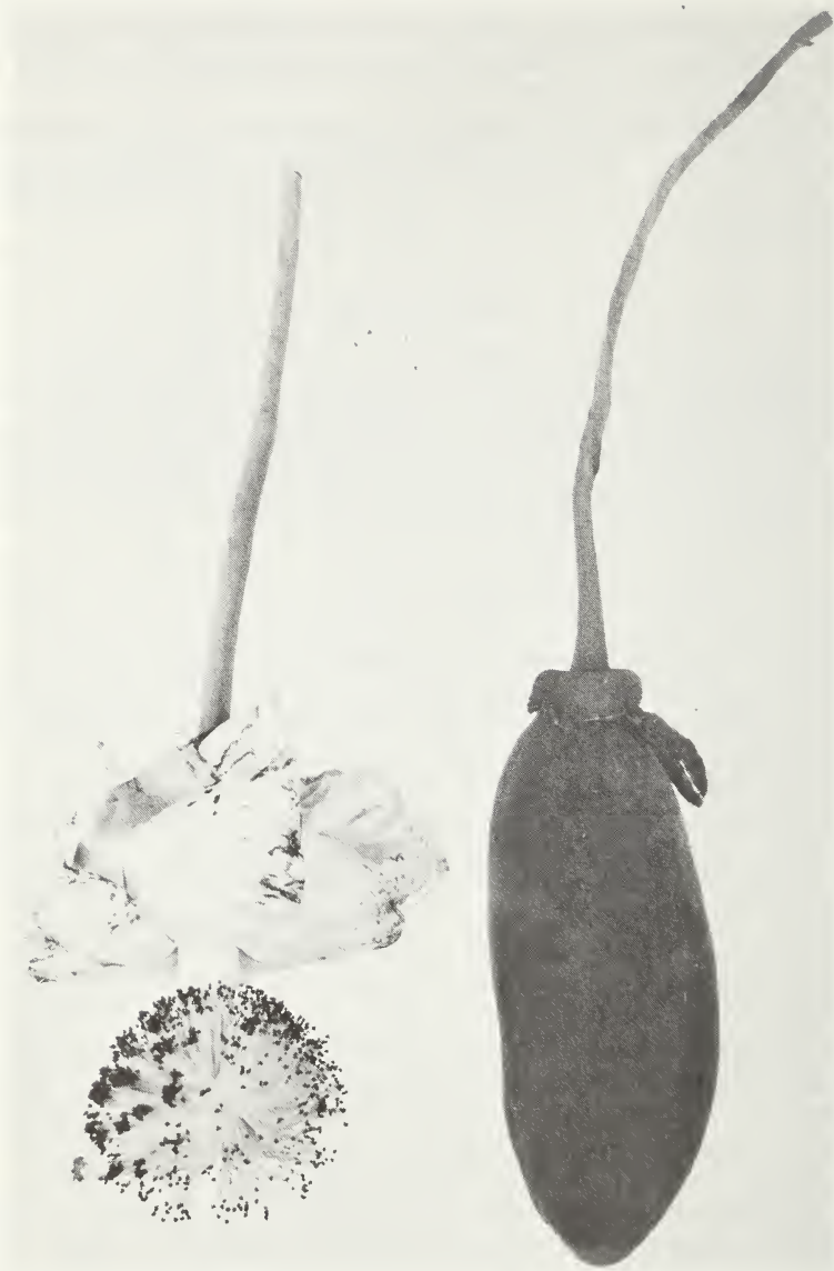
Figure 29.—The flower and fruit of Adansonia digitata , baobab.