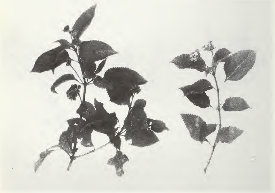
Figure 49.— Lantana camara with its colorful flowers and fruits.