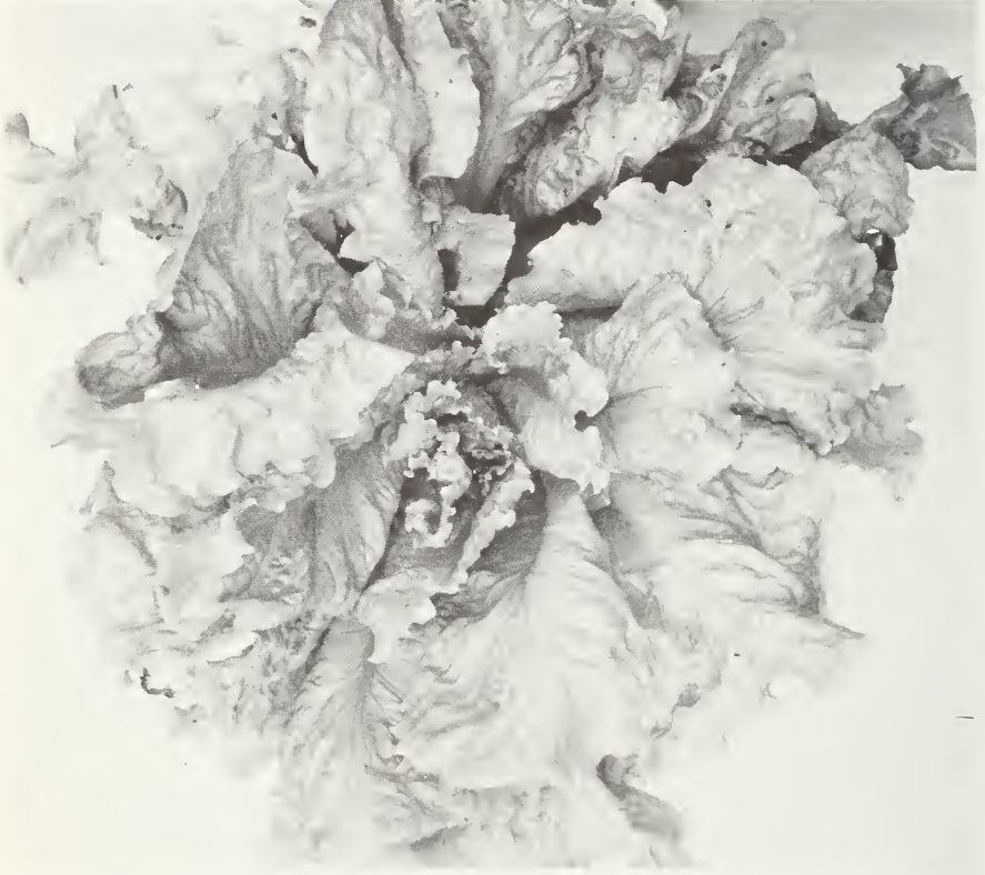
Figure 39.—A leaf-lettuce, Black Leaved Simpson, that does well in the tropics.