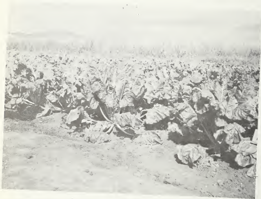
Figure 38.—A sugar beet field in Puerto Rico, with large edible leaves.