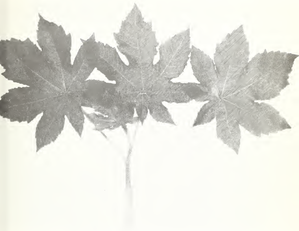
Figure 44.—The castor bean, poisonous plant, the leaves of which are processed for eating.