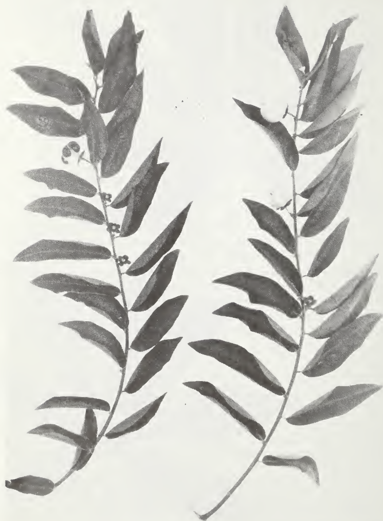
Figure 8.—Leaves, flowers, and fruit of Sauropus androgynus .