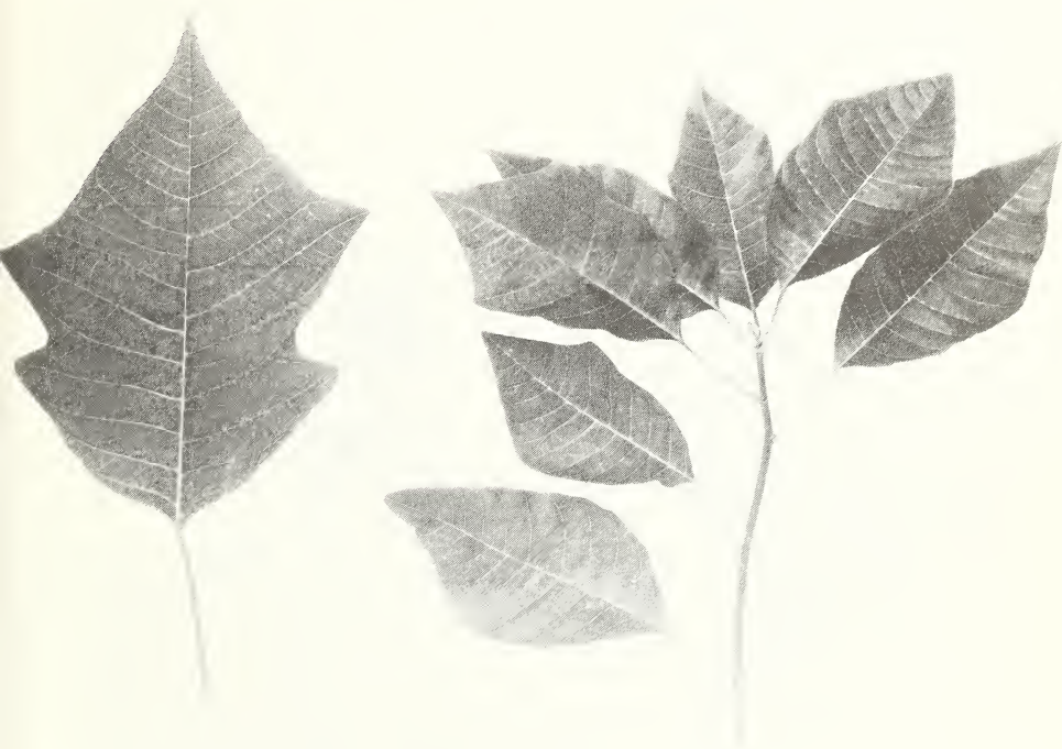
Figure 13.—Leaves of Euphorbia pulcherrima , the poinsettia, a debatable species.