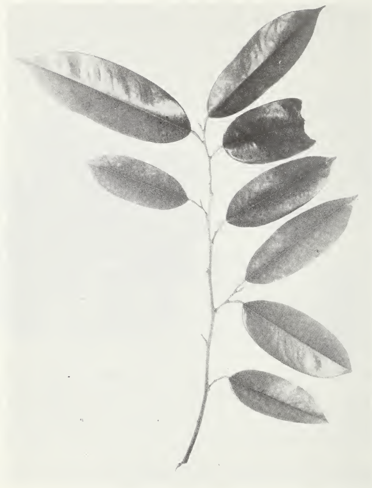
Figure 16.—The edible leaves of the durian, Durio zibethinus .