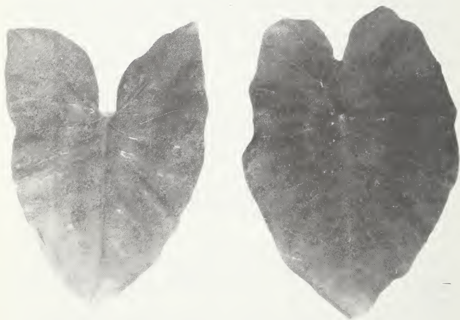
Figure 3.—Leaves of Xanthosoma (left) and Colocasia (right).