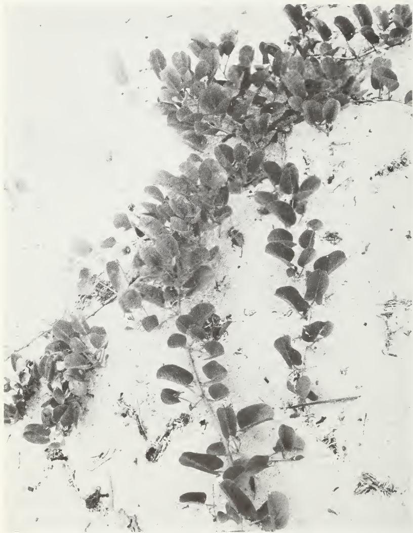
Figure 22.—Foliage and flower of the beach morning glory, Ipomoea pes-caprae .