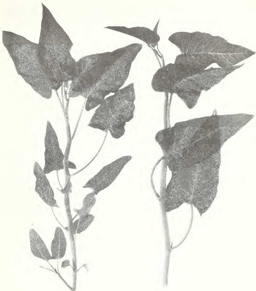
Figure 5.— Ipomoea aquatica , Kangkong, at the proper stage for use as a pot herb.