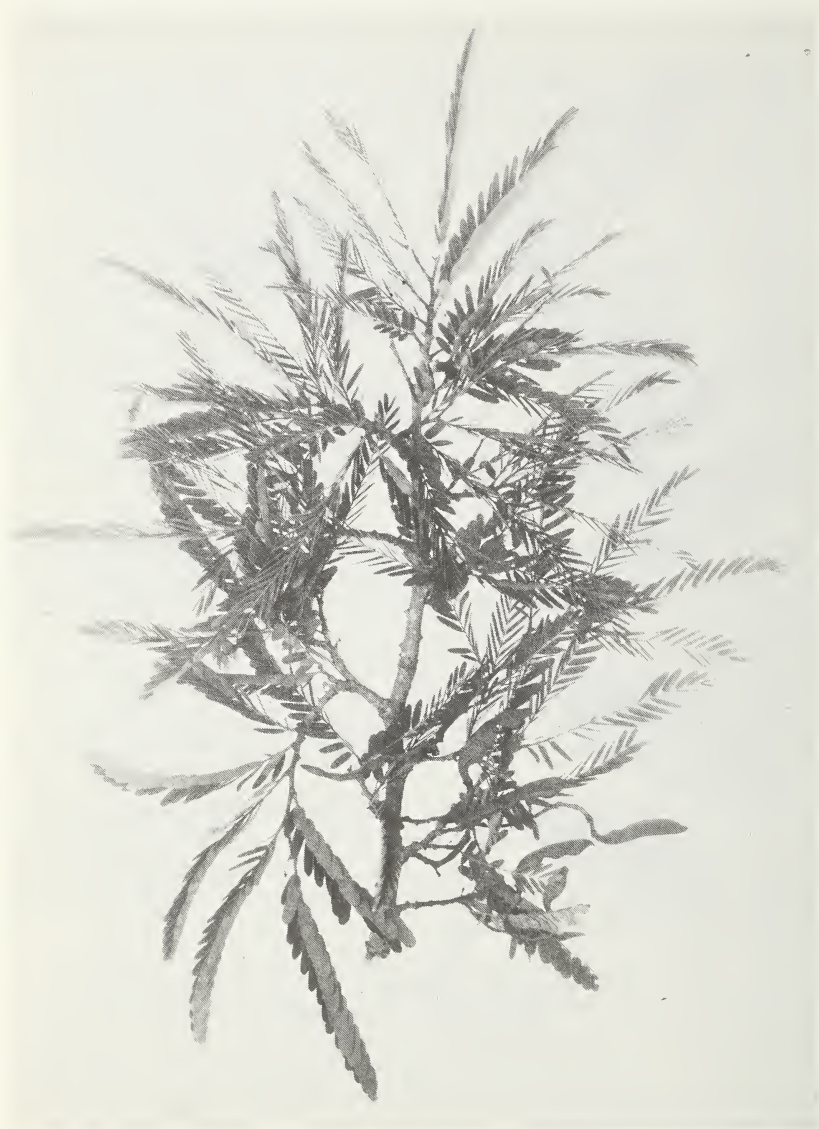
Figure 17.—A branch of tamarind, Tamarindus indica , with edible tips and young fruits.