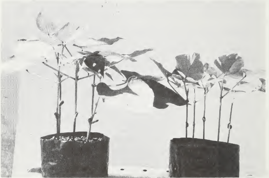
Figure 53.—Plants showing symptoms of nitrogen deficiency (right) compared to healthy plants of the same age (left).