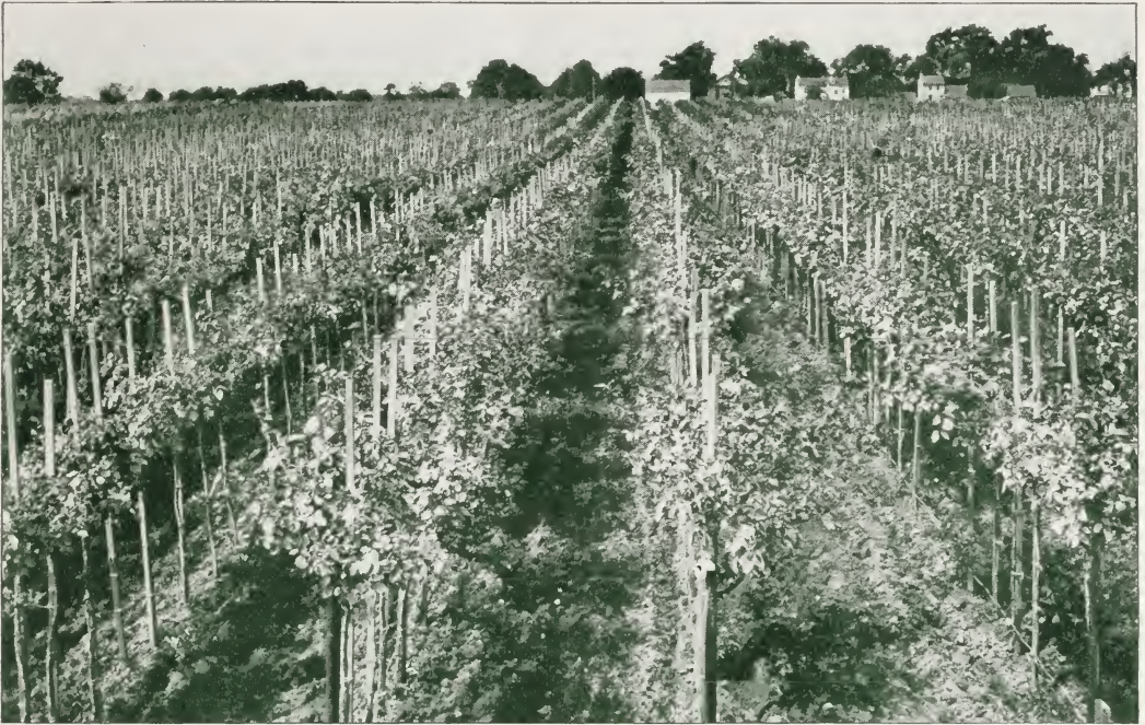
Tree Roses, a J. & P. specialty at Shiloh, are available this year in good assortment, double budded heads on strong, sturdy stems