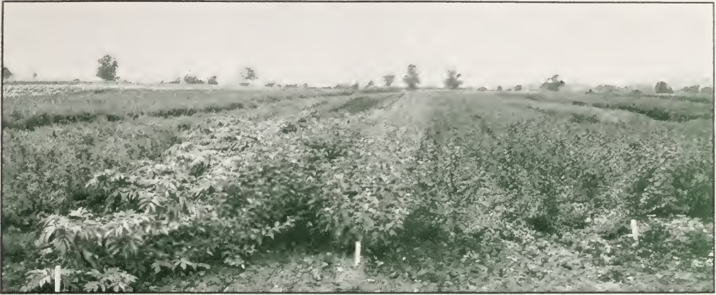
One of our Newark blocks of two-year shrubs, photographed August 10, 1931