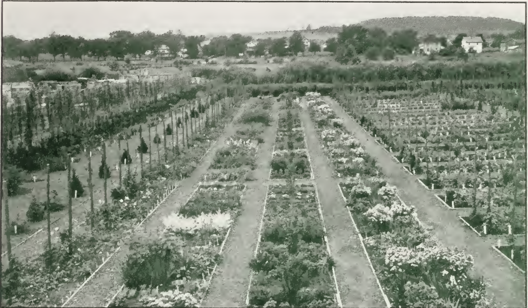
The Perennial Department of the J. & P. Company conducts most thorough and careful tests of both old and new varieties. Improved types are collected and seeds saved. We are trying to grow the best varieties in each class, and to make available for you uniform and dependable stock.