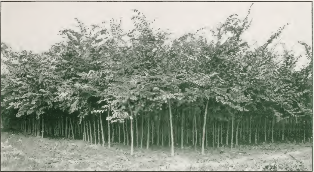
One corner of a block of American Elms at Newark, photographed August 11