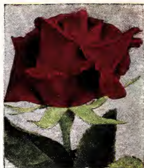
Etoile de Hollande