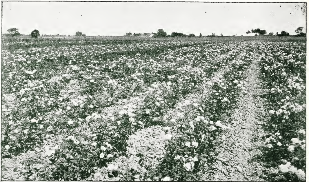
Another block of J. & P. preferred Roses, carefully grown, properly dug, and well graded. Modern methods are employed throughout