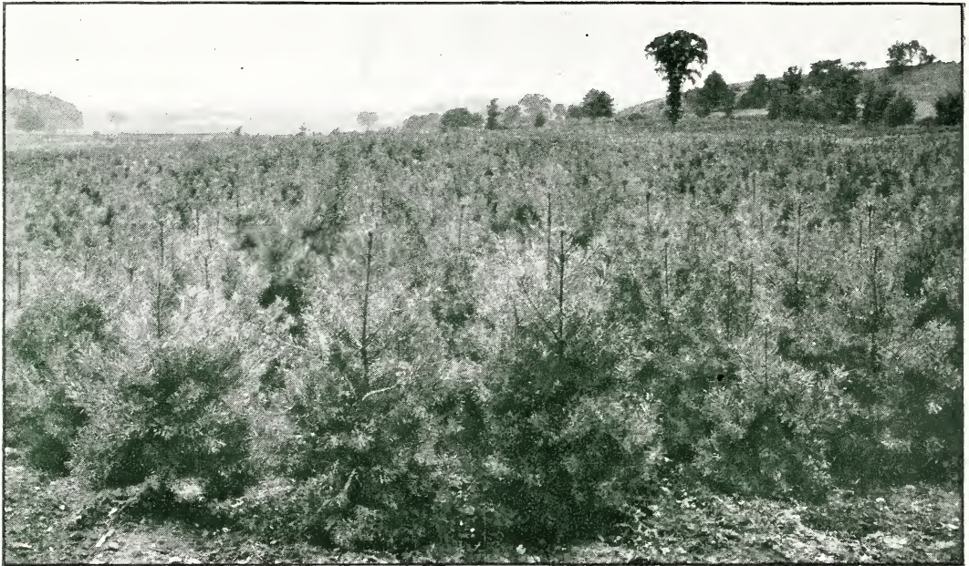
Our block of 3 to 4-foot and 4 to 5-foot Scotch Pine at Newark. Photographed August 10