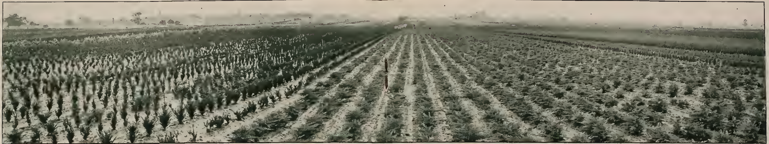
A panoramic view of our Shiloh Evergreen Nursery, with office and other buildings in the background. Climate and soil conditions here are ideal. These, with expert knowledge of correct growing and pruning methods, coupled with skilled labor, produce real money-making Evergreens