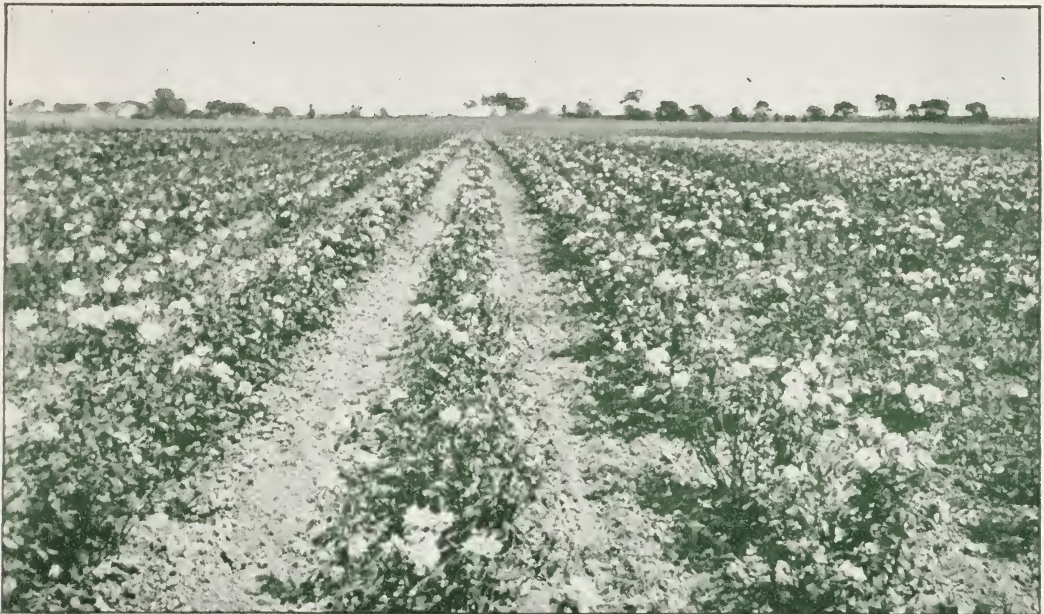
A few of our Hybrid Tea Rose blocks at Shiloh. Mme. Butterfly and Ophelia in the immediate foreground