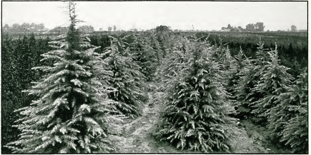
Cedrus deodara in our Shiloh nurseries. Photographed this August