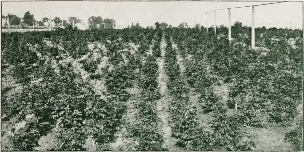
Japanese Red Maple, grafted plants, in our Shiloh nurseries; heavy calipered, stocky plants. Photographed August 12