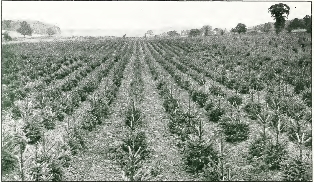
A view of our Evergreen Department at Newark, showing Norway Spruce in the foreground and Scotch Pine at the extreme right