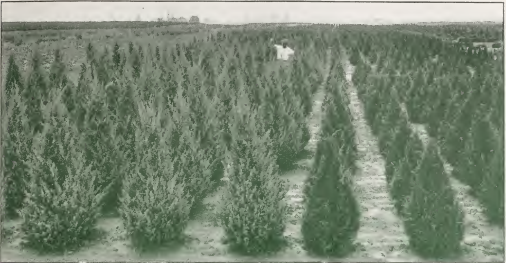
Juniperus chinensis columnaris at left. Juniperus chinensis at right. Photographed August 10, 1931