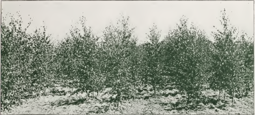
Cut-leaf Weeping Birch, another J. & P. specialty. Give it plenty of room in the nursery row to develop properly