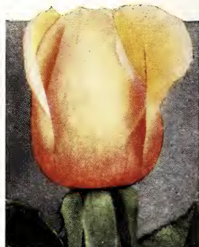
Duchess of Wellington