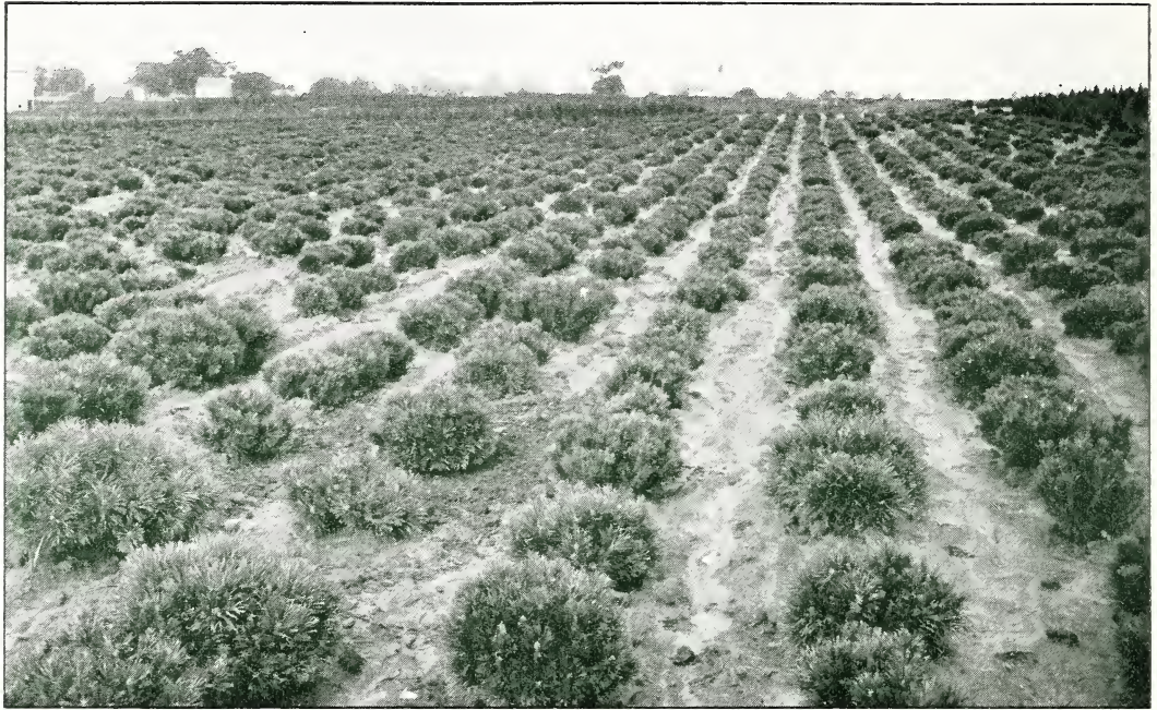
Mugho Pine in our Shiloh nurseries. Photographed this August