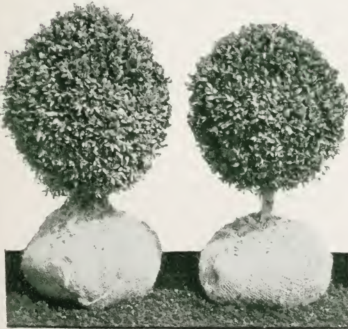
Boxwood, balled, 10 to 21 inches, dug from the block shown above