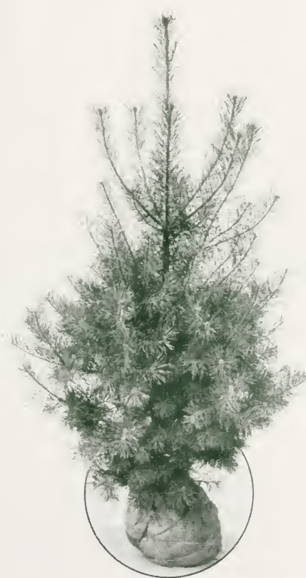
A J. & P. Scotch Pine from the block shown on page 46