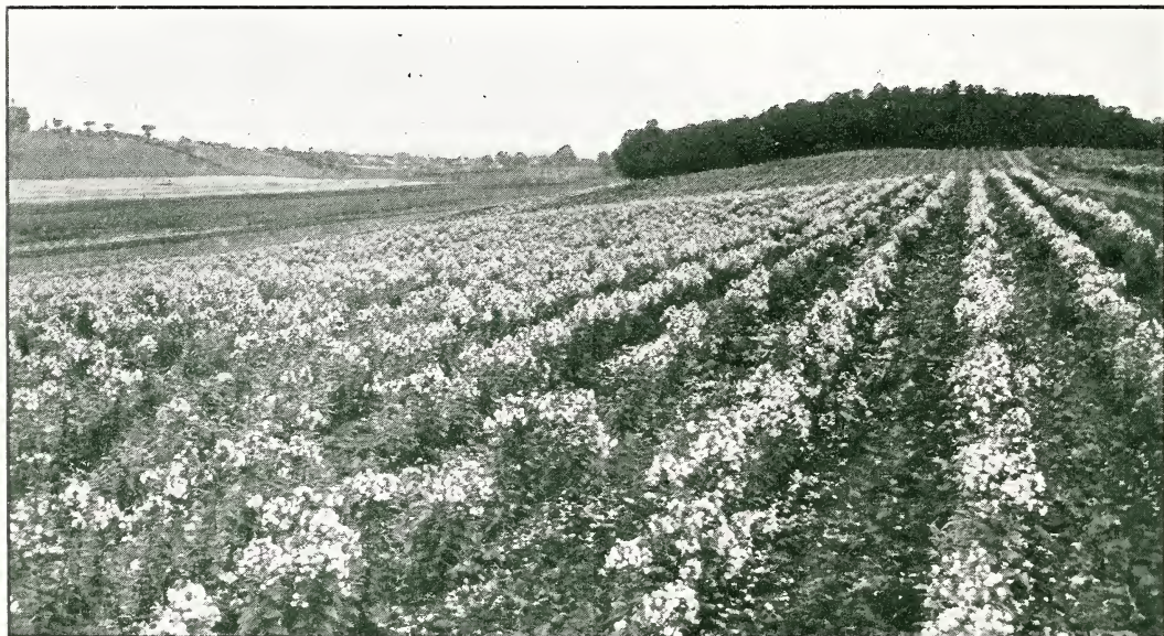
Hardy Phlox, long a J. & P. specialty, are available in quantity and in heavy, field-grown, transplanted stock. The assortment has been improved for this season