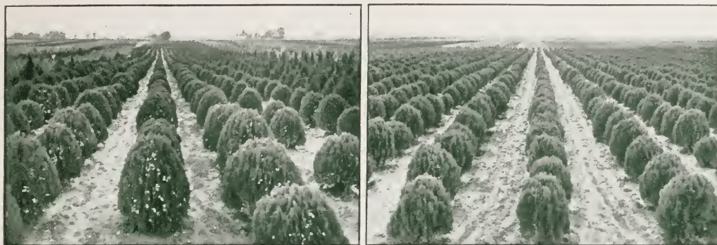
Berckman's Golden Arborvitæ available in a good range of sizes in properly and carefully grown plants. These two photographs taken August 12, 1931