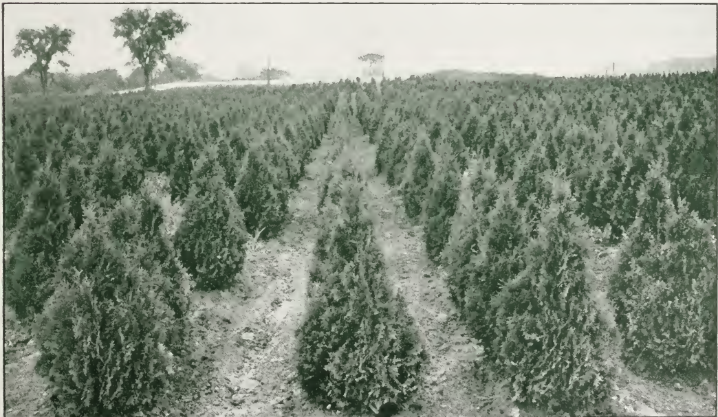
Pyramidal Arborvitæ at Newark, given plenty of room to develop into heavy plants