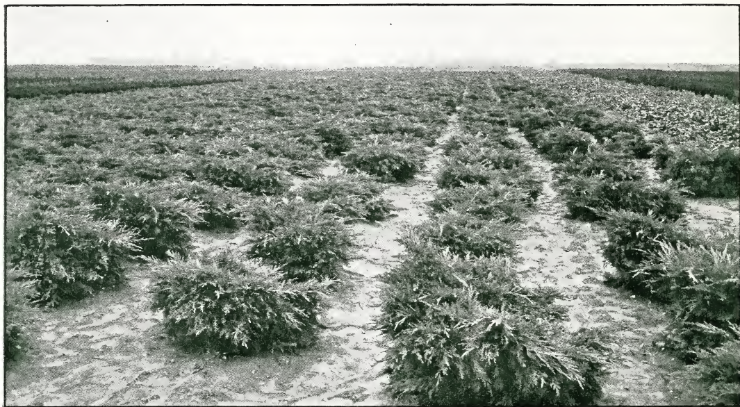
Pfitzer's Juniper at our New Jersey branch. This photograph, taken August 12, needs no comment