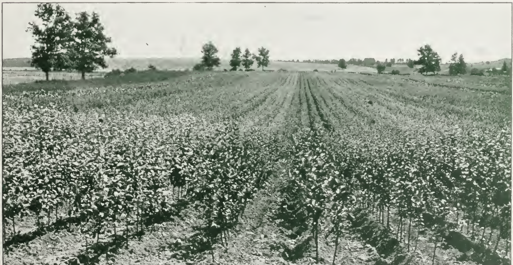
A block of 2-year budded Apples at Newark. Left to right, Baldwin, Cortland, Delicious, McIntosh

¼ in., branched. No. 1, ⅜ in. and up, branched.