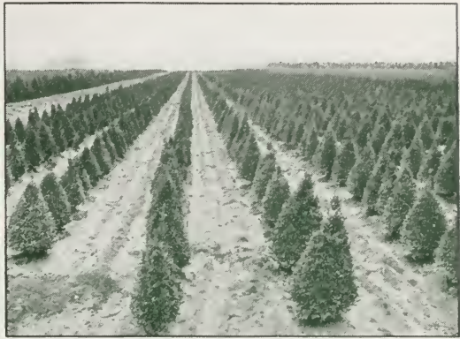
Buxus sempervirens (pyramid and ball shape), in our Shiloh nurseries. Photographed August 12