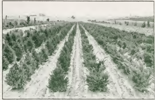
Taxus capitata at the left; Taxus cuspidata at the right