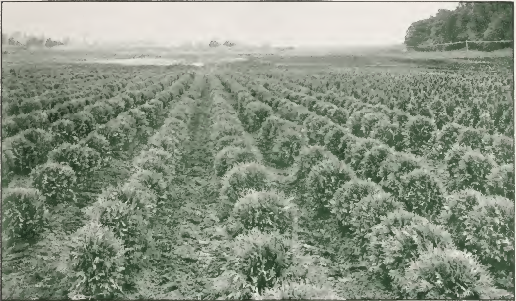
Globe Arborvitæ growing in our Newark nurseries and photographed in August