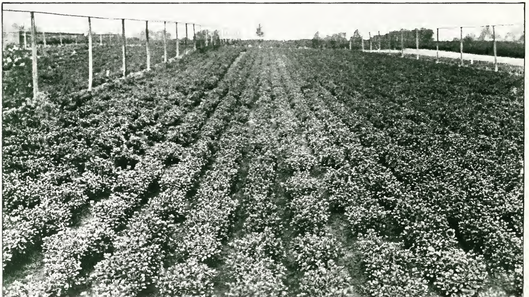
Azalea Hinodegiri at Shiloh, properly spaced to develop well-rounded plants