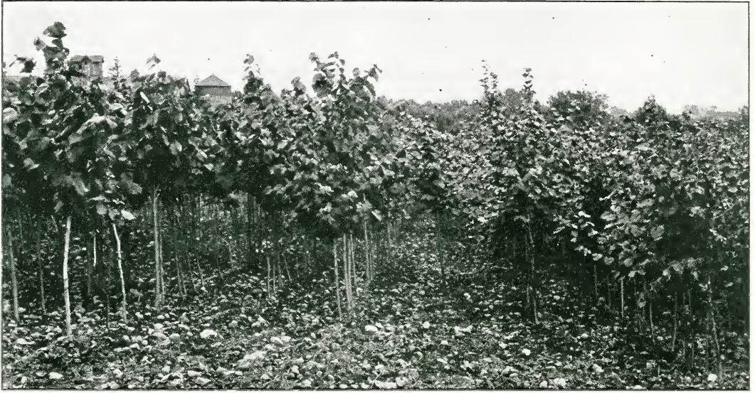
American Linden at the right, with European Linden at the left, photographed August 10, 1931