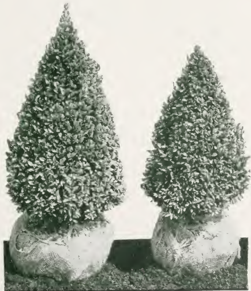
Pyramidal Boxwood from the above block