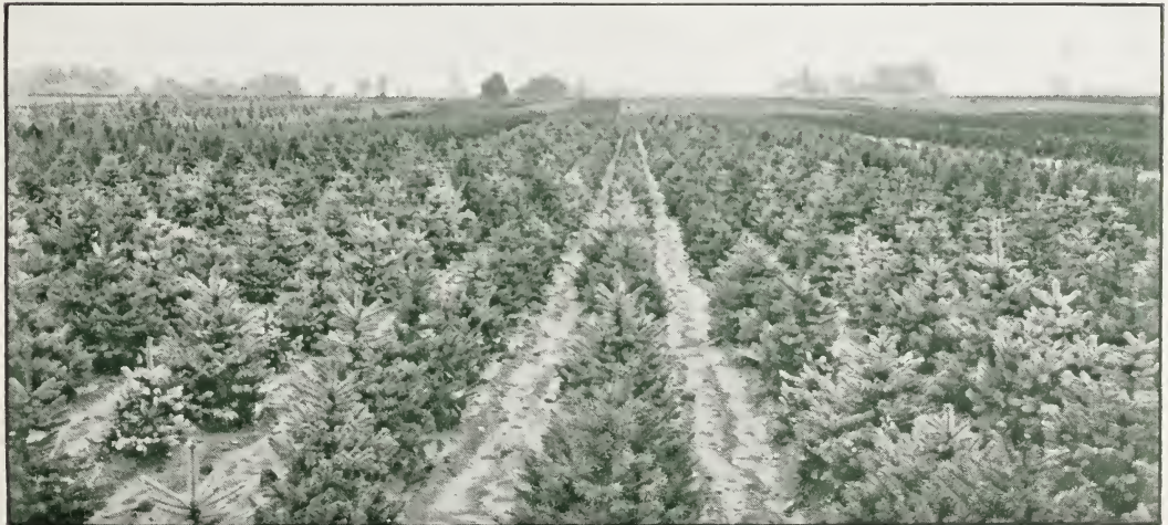
Colorado Spruce, Blue and Green, with a good percentage of well-colored Blue, growing at Shiloh. Photographed this summer