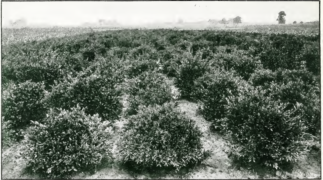
Ligustrum lucidum in our Shiloh nurseries. Photographed this summer