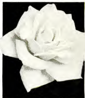
Mme. Jules Bouche