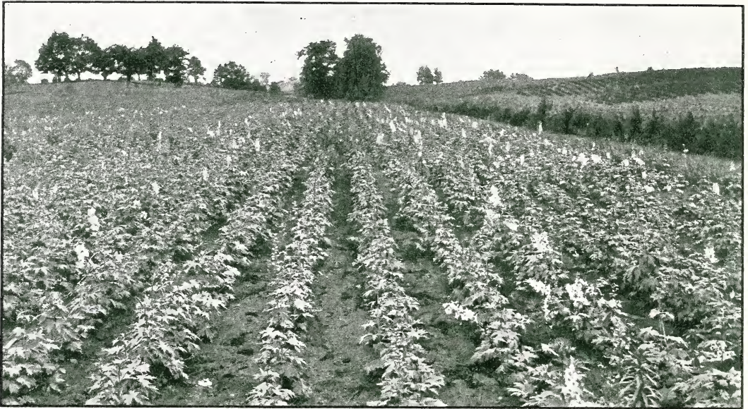
A young block of new Hybrid Delphiniums photographed August 10, 1931. The Delphinium surely deserves its present popularity