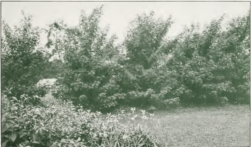
Pyramidal Maple used as a screen, 5 to 6-foot trees planted three years ago and photographed this August

We cannot undertake to supply long and much assorted lists of stock calling for only small bundles of each kind as our business is exclusively wholesale and we do not have the facilities to handle retail orders