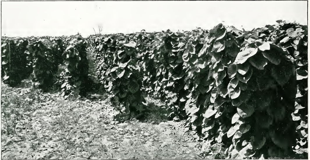
Dutchman's Pipe at Newark. Real he plants. True Aristolochia siphon