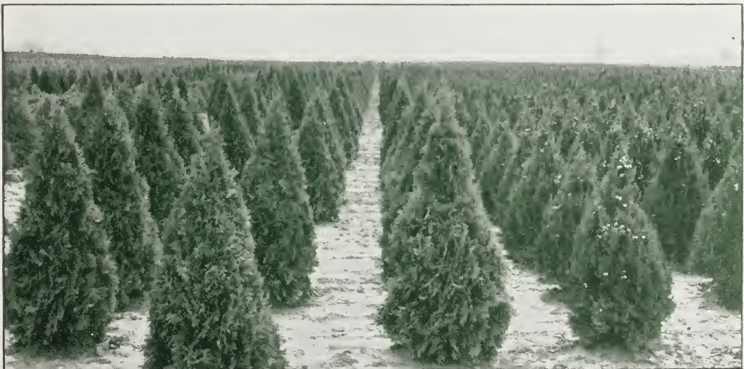
Thuja pyramidalis at the left. Thuja orientalis elegantissima at the right. Both available at Shiloh in good sizes this year

We cannot undertake to supply long and much assorted lists of stock calling for only small bundles of each kind as our business is exclusively wholesale and we do not have the facilities to handle retail orders