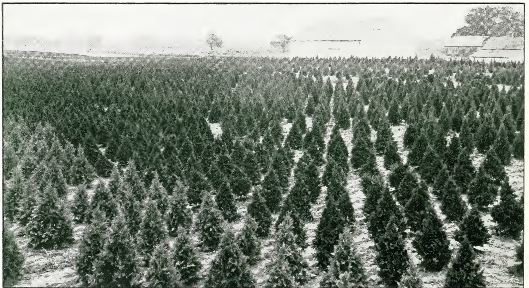
A general view of our Evergreen planting at Shiloh