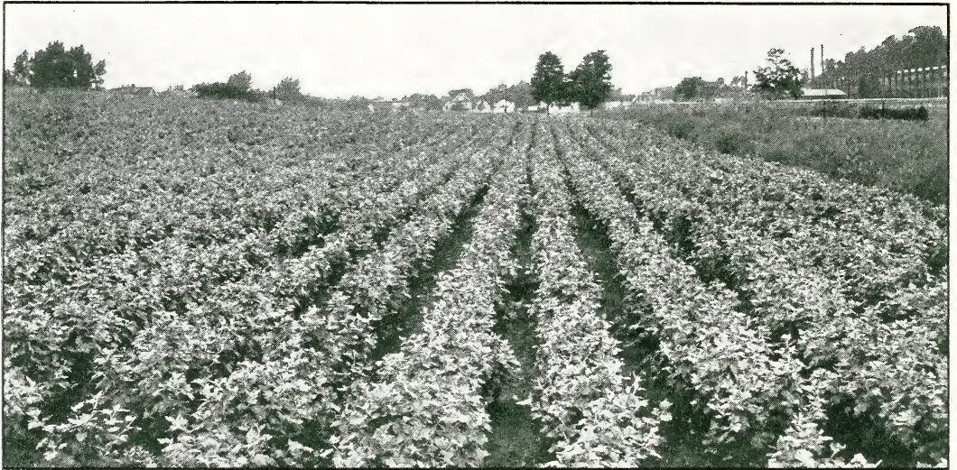
Our 1931 block of Hardy Chrysanthemums, photographed August 10, 1931. The assortment available has been selected to avoid duplication in color and shade and to provide early-blooming sorts