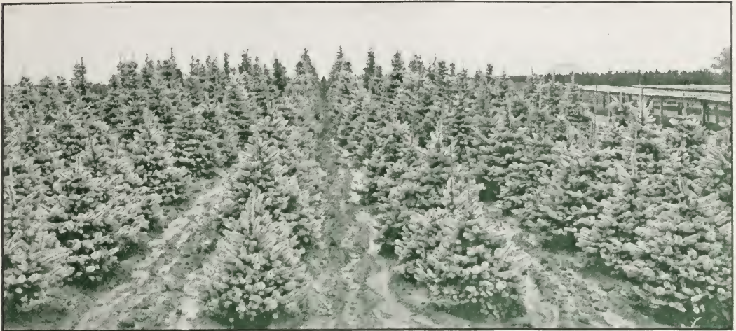
Koster's Blue Spruce is available at Shiloh in sizes ranging from 18 inches to 7 feet. Photographed August 12, 1931