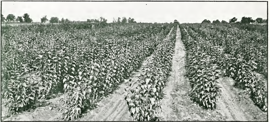
Our block of two-year Hybrid Lilacs at Shiloh. Photographed August 12, 1931