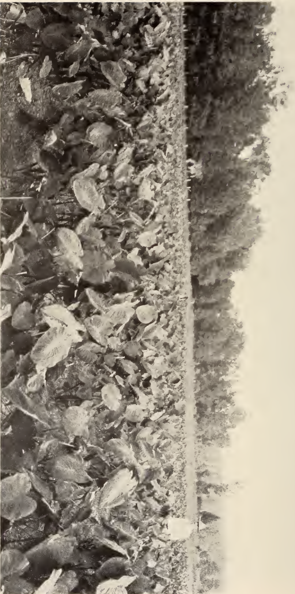
Colocasia esculenta , the dasheen, as grown in a five-acre field at the Brooksville Field Station. The dasheen does excellently in some parts of the South on soils where the potato would fail.