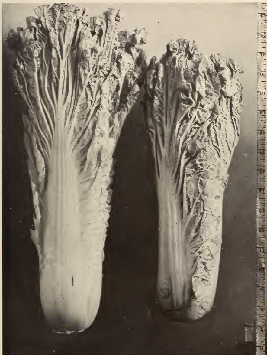
Brassica pekinensis , the pai ts'ai of northern China, one of the best fall and winter vegetables. Keeps well and brings a good price in the late fall and winter.