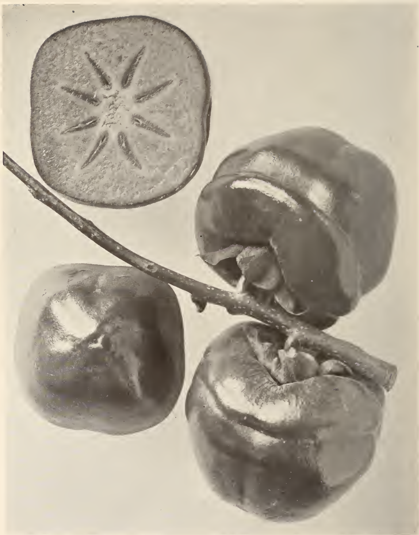
Diospyros kaki , the "lotus-flower" persimmon of northern China, a seedless persimmon, marked by peculiar furrows around the base and across the top of the fruit. Not hardy in the northern United States.