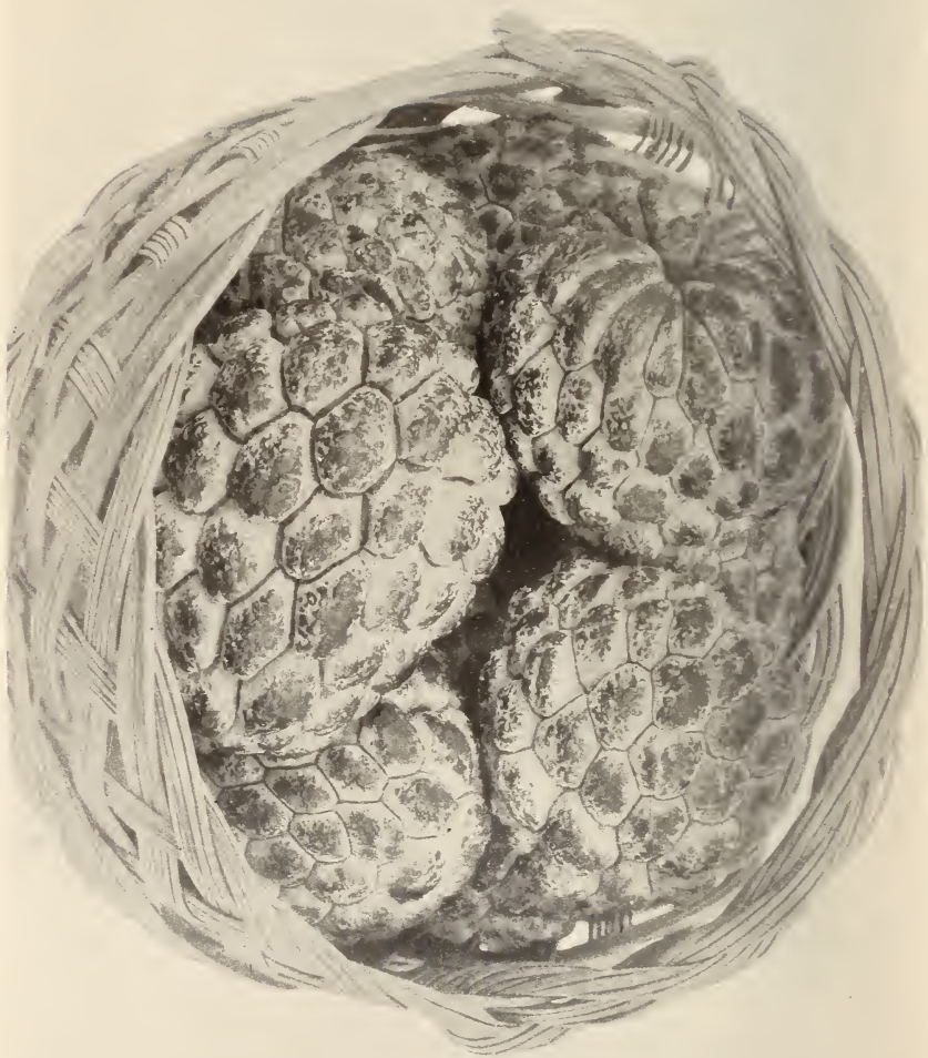
Annona squamosa , the sugar-apple, a tropical fruit with sweet, melting, creamy white flesh, worthy of wide cultivation in south Florida and southern California.