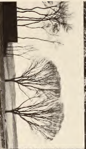
Salix sp., a northern Chinese willow, which promises to be of great value as an ornamental in dry regions.