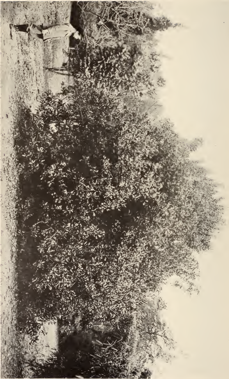
Macadamia ternifolia , the Queensland nut, a very ornamental but tender nut tree, with very hard-shelled nuts about the size of large filberts. The kernels are of excellent quality.