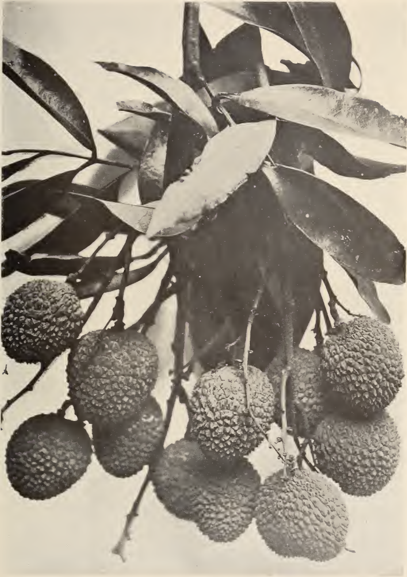
Litchi chinensis, a favorite southern Chinese fruit, eaten as a fresh or dried fruit and greatly esteemed for its delicate flavor.