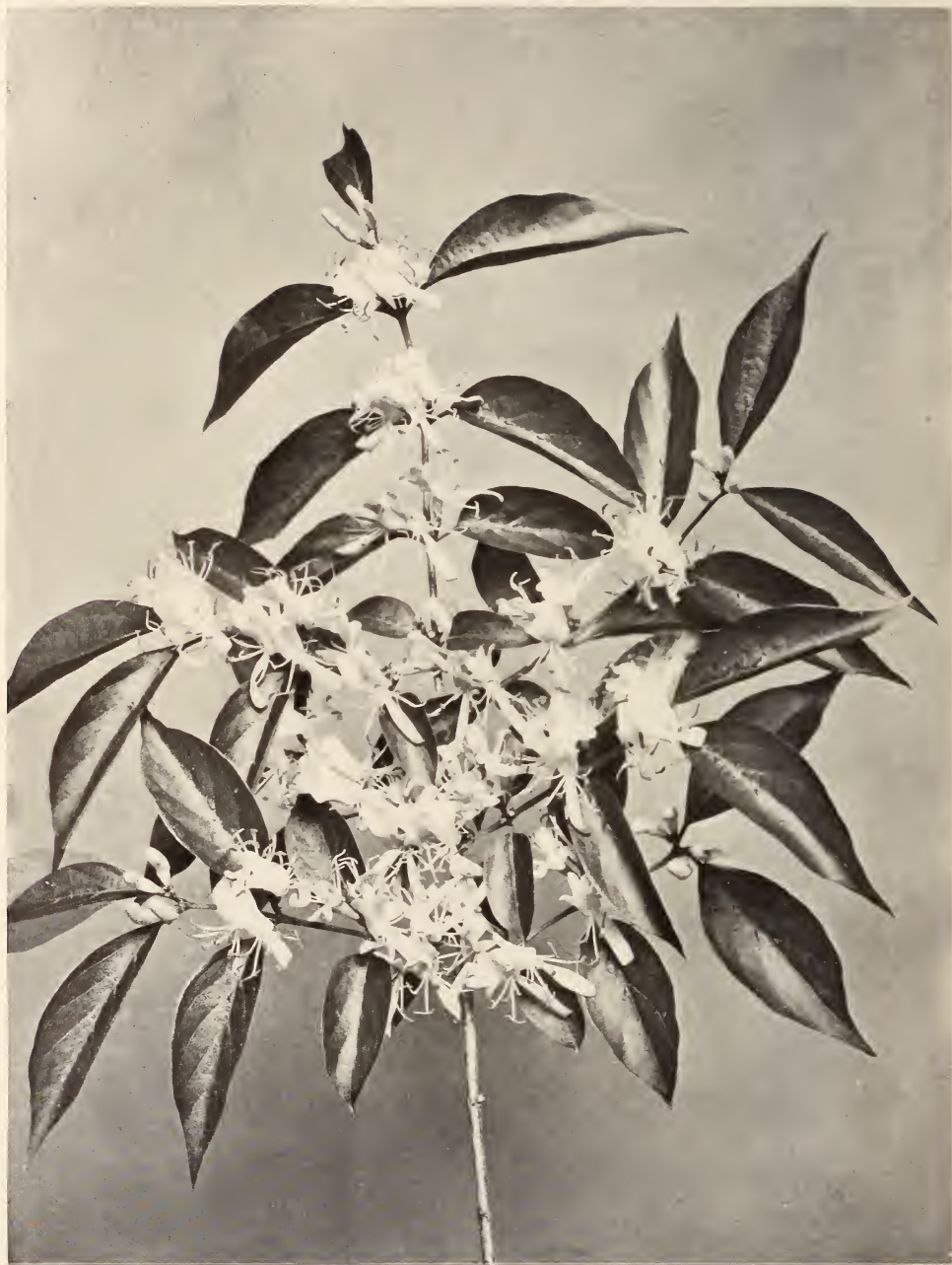
Lonicera maackii , a very ornamental spreading, shrubby, honeysuckle, with white flowers tinted pink, turning yellow with age.