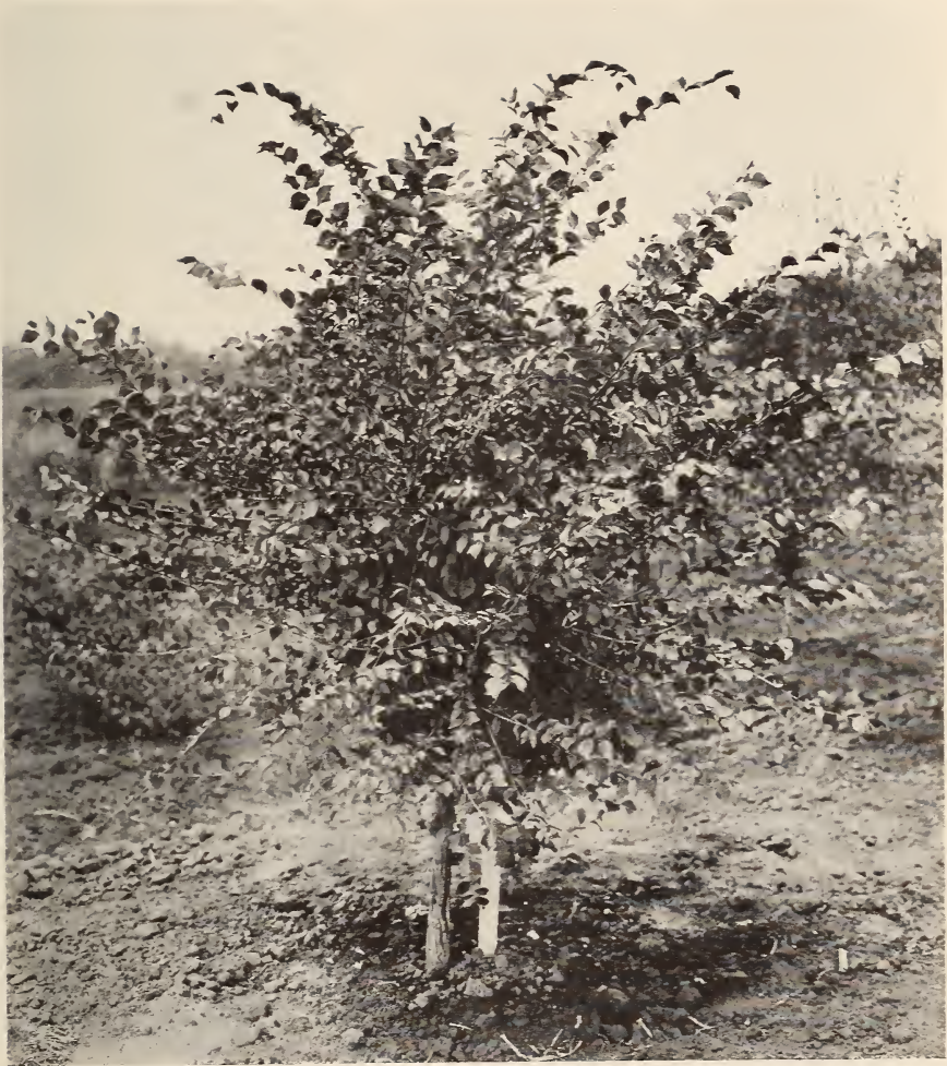
Ulmus densa , a Turkestan elm, with round dense head, suited for cultivation in arid regions under irrigation.