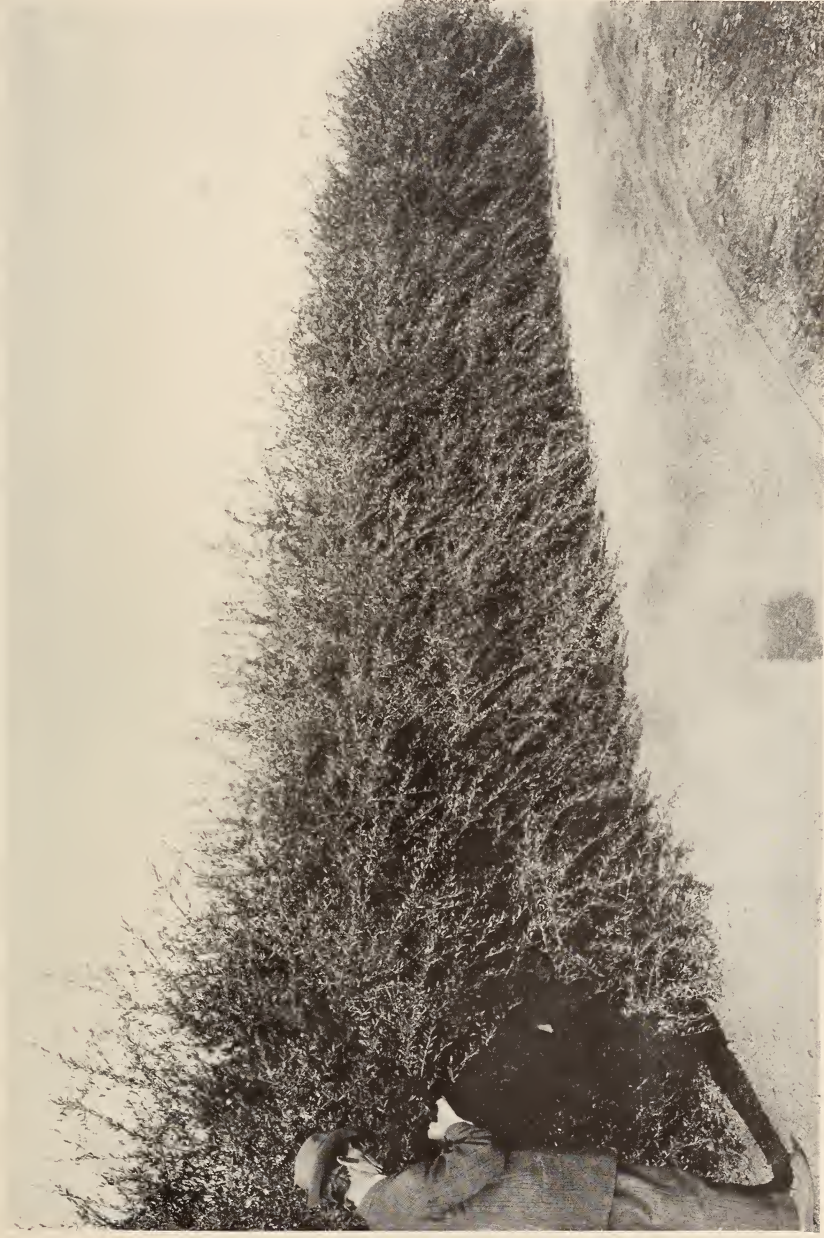
Maytenus boaria, a Chilean shrub, well adapted for ornamental purposes, as well as for hedges in mild climates. Does well under dry adverse conditions.