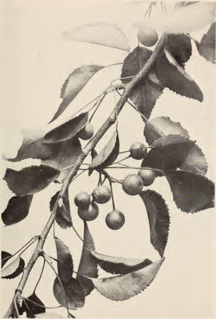
Pyrus betulaefolia , a northern Chinese wild pear with small fruits, of possible value as a stock for other species.