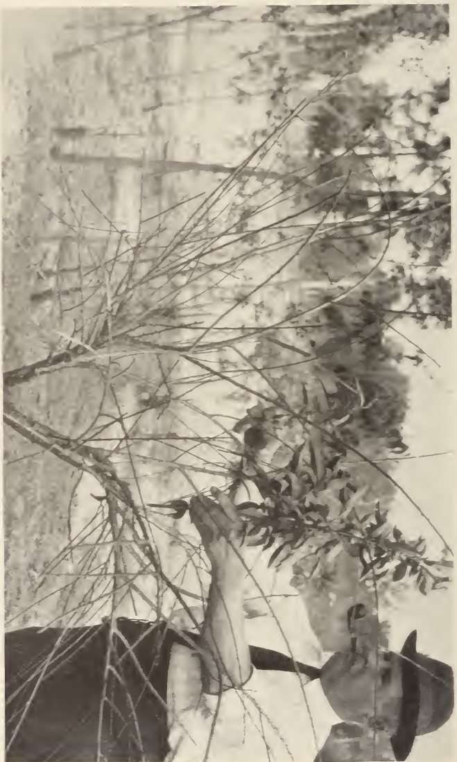
Prunus mira , a western Chinese peach, with smooth stone, which flowers much later than ordinary peaches, and may prove valuable in breeding to secure late-flowering strains.