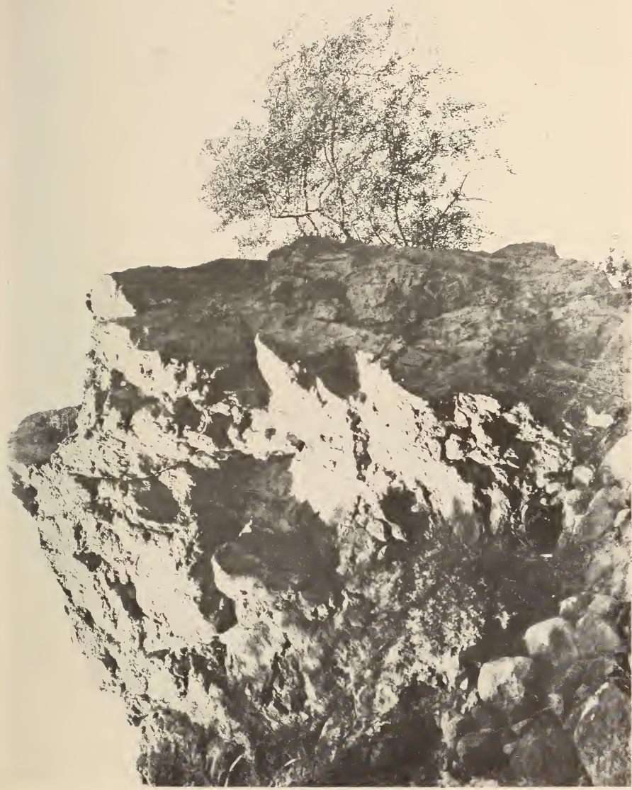
Amygdalus tangutica , a bush almond, up to 10 feet high, from western China, very drought, cold, and heat resistant, and also an attractive ornamental.