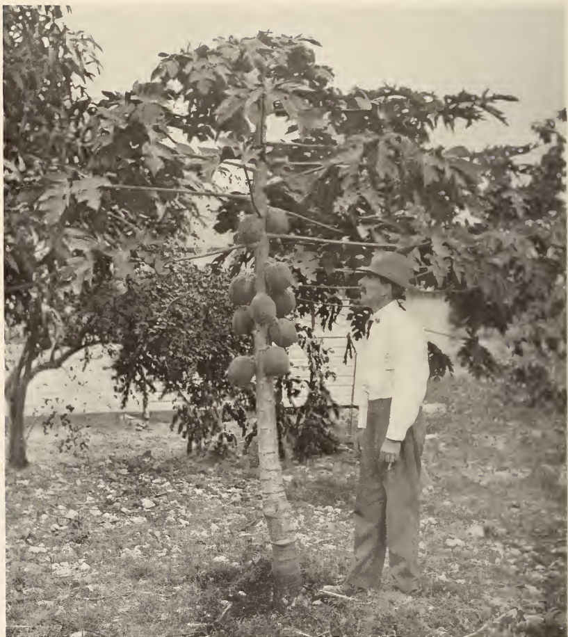
Carica papaya , the common papaya or tree melon of the Tropics, as a grafted plant.