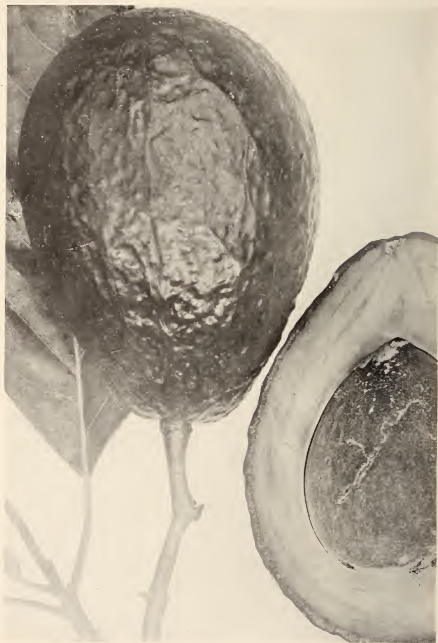
Persea americana , Taylor avocado, a variety of the Guatemalan type, which ripens its fruits through the early spring.