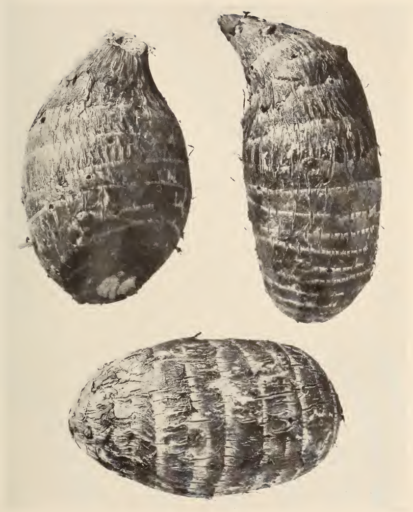
Colocasia esculenta , tubers of the dasheen of a size suitable for marketing. These tubers may be cooked in the same way as potatoes.