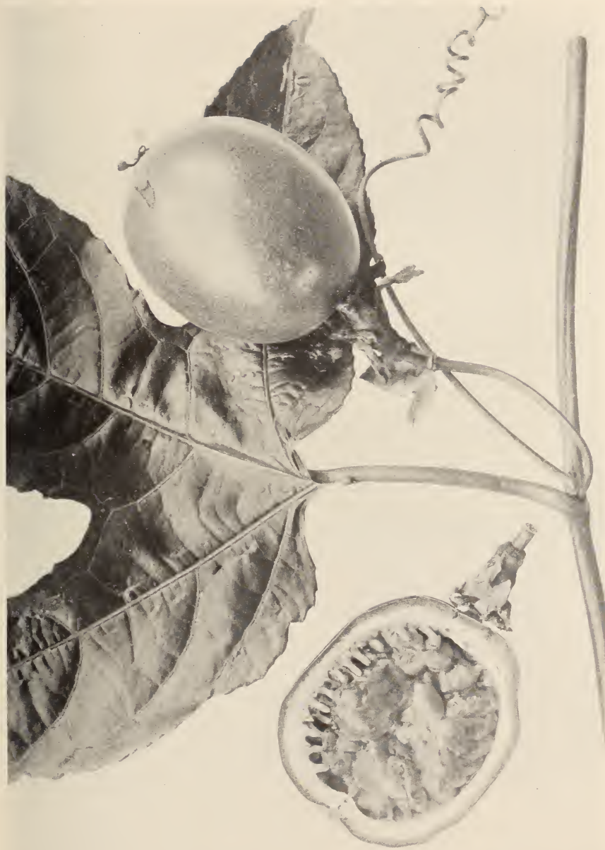
Passiflora edulis , a delicious fruit with many seeds embedded in a watery pulp, suitable for eating, flavoring ices, or as an 'ade.